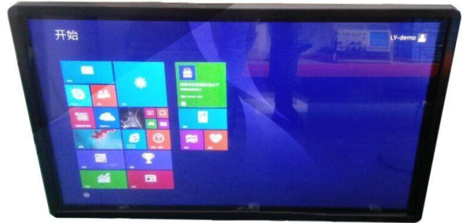
LCD 面板 Display panel