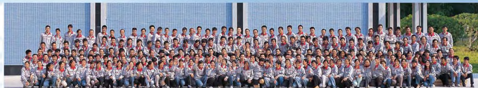
Manufacturing Staff – With decades of combined experience behind them, these guys are the best of the best when it comes to delivering the highest-quality products. Their dedication and commitment to going above and beyond is evident in everything they do.