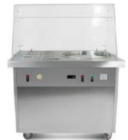
Roller Ice Cream Machine

Model: FIR-PF1R-6C(Square Type) Dimension: 100x65x88cm Packing Size: 105x70x93cm Volts: 220V/50HZ Power: 2.4KW N.W.: 68KGS G.W.: 76KGS