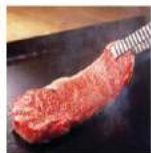
Counter Top Gas Lava Rock Grill

Model: HGL-607 Dimension: 650x612x530mm Hp: 57.6MJ Valve Type: Low-pressure Valve Butners: 2 N/W: 49Kg