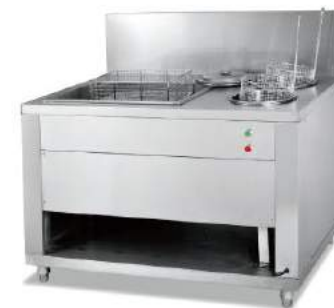
Electric Breading Table

Model: HML-809 Dimension: 953x680x914mm Volts: 220-240V/50-60Hz Power: 0.3KW N/W: 75Kg