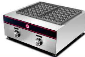
Gas 2-Head Fish Grill

Model: HX-56 Dimension: 470x470x260mm Volts: 220V/50Hz Power: 4KW N/W: 28Kg