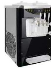
Soft Ice Cream Machine

Model: HIM-08 Machine: 570x780x1500mm Packing: 630x835x1650mm Volts: 220-240V/50-60Hz Power: 4.2KW Output: 60-75L/Hour Refrigerant: R22/R404A N/W: 190Kg