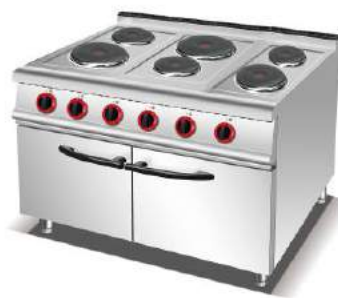
Electric 6-Hot-Plate Cooker With Cabinet

Model: HRQ-962 Dimension: 1200x900x920mm Power Supply: 2x2+2.6x2KW Voltage: 380V