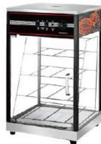
Pizza Display Warmer

Model: HW-816 Dimension: 490x490x810mm Volts: 220-240V/50-60HZ Power: 0.65KW Weight: 15Kg