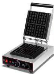
1-Plate Waffle Baker

Model: HCB-2 Dimension: 570x380x230mm Volts: 220-240V/50-60Hz Power: 2KW N/W: 12.4Kg