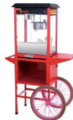
Popcorn Machine with Cart

Model: HP-DC Dimension: 910x490x1630mm Volts: 220-240V/50-60Hz Power: 1.5KW N/W: 38Kg