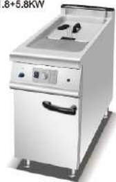
Gas 1-Tank Fryer With Cabinet

Model: HGF-908 Dimension: 400x900x920mm LPG2800-3700Pa: 1.23Kg/h NG2000-2500Pa: 1.56m 3 /h Power Supply: 15.5KW Capacity: 20± 2L