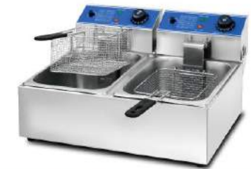
2-Tank 2-Basket Electric Fryer

Model: HEF-82A (2-Tank 2-Basket) Dimension: 550x430x290mm Packing Size: 570x455x315mm Capacity: 6L+6L Volts: 220V-240V/50-60Hz Power: 2.5+2.5KW N/W: 9Kg