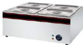
Electric Bain Marie

Model: HB-750 Dimension: 750x750x280mm Volts: 220-240V/50-60Hz Power: 3KW N/W: 18Kg