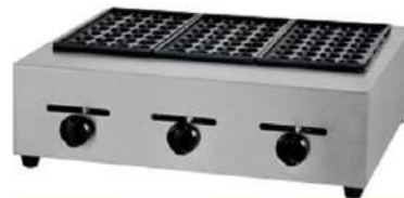
Gas 3-Head Fish Grill

Model: HX-65 Dimension: 740x470x260mm Volts: 220V/50Hz Power: 6KW N/W: 42Kg