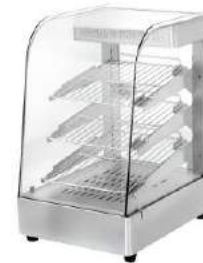
Food Display Warmer

Model: HW-861 Dimension: 350x455x580mm Volts: 220-240V/50-60Hz Power: 1.3KW N/W: 21Kg