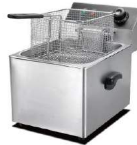
1-Tank 1-Basket Electric Fryer

Model: HEF-8L Dimension: 310x410x340mm Packing Size: 450x390x380mm Volts: 220V-240V/50-60Hz Power: 2.8KW N/W: 6.2Kg