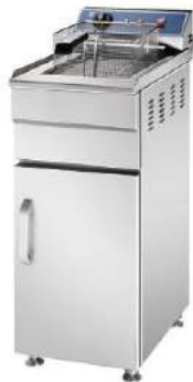
1-Tank 1-Basket Electric Fryer

Model: HEF-161C Dimension: 340x530x940mm Capacity: 16L Volts: 220-240V Power: 5KW N/W: 20.6Kg