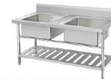
Binary Wash Dish Even Things