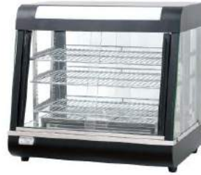
Food Display Warmer

Model: HW-3PS Dimension: 950x480x630mm Volts: 220~240V/50~60Hz Power: 1.2KW N/W: 30Kg