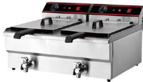
2-Tank 2-Basket Electric Fryer