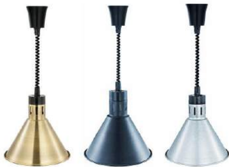
Bronze Black Silver

Model: A033 Power: 220V/250W Diameter: 270mm Adjustable height: 0.6~1.8m