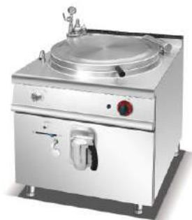
Gas Indirect Jacketed Boiling Pan

Model: ZH-RS80 Dimension: 800x900x920mm LPG2800-3700Pa: 1.51Kg/h NG2000-2500Pa: 2.19m 3 /h Pressure: 21kpa Capacity: 80L