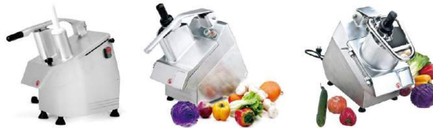
Multi-Purpose Electric Vegetable Cutter