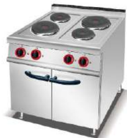
Electric 4-Hot-Plate Cooker With Cabinet

Model: HRQ-912 Dimension: 800x900x920mm Volts: 380V Power: 2x2+2.6x2KW