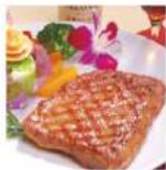
Counter Top Gas Griddle

Model: HGR-606 Dimension: 600x612x530mm Hp: 28.8MJ Valve Type: Low-pressure Valve Butners: 2 N/W: 46Kg