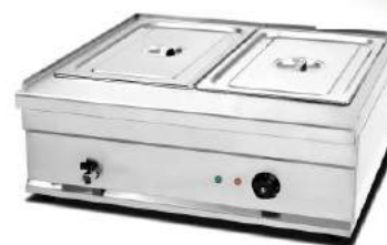
Electric Bain Marie

Model: HB-904 Dimension: 715x560x380mm Volts: 220-240V/50-60Hz Power: 1.6KW N/W: 27Kg