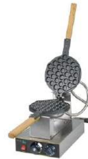
Hong Kong Egg Waffle Maker

Model: HWB-2S Dimension: 570x380x230mm Volts: 220-240V/50-60Hz Power: 3.2KW N/W: 20.5Kg