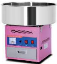
Electric Candy Floss Machine

Model: HEC-03N Dimension: 520X520X300mm Packing Size: 53x53x32mm Volts: 220-240V/50-60Hz Power: 0.93 KW