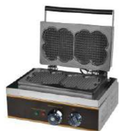
Lolly Waffle Maker

Model:HX-216 Dimension: 390x340x245mm Packing Size:435x410x305mm Volts:220-240V/50-60Hz Power:1.55KW N.W.:10Kg G.W.:11Kg Single Pie Size: 140xØ40mm Cake Depth:15mm