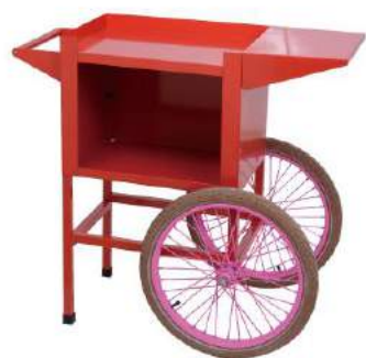
Popcorn Machine Cart

Model: HP-2488 Dimension: 505x350x680mm Volts: 220-240V Power: 1.2KW N/W: 22Kg