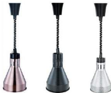
Bronze Black Silver