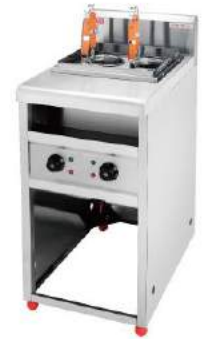
Electric Pasta Cooker

Model: HEN-6A Dimension: 590x550x280mm Volts: 220-240V/50-60Hz Power: 6KW N/W: 17Kg