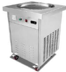
Roller Ice Cream Machine

Model: FIM-A30 Dimension: 830x440x700mm Volts: 220V/50Hz Power: 1.8KW Output: 25Kg/hour N/W: 60Kg