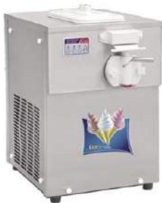
Ice Cream Machine

Model: HIM-01 Dimension: 570x740x750mm Volts: 220-240V/50-60Hz Power: 0.9KW Output: 8-11Kg/Hour(13-18L) Refrigerant: R22/R404A N/W: 59Kg