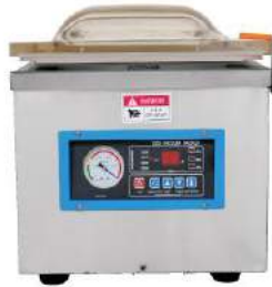
DZ260T DZ300T DZ400T