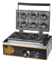
Korean Mini Taiyaki Maker

Model:HX-116 Dimension: 390x340x245mm Packing Size:435x410x305mm Volts:220-240V/50-60Hz Power:1.55KW N.W.:8Kg G.W.:9Kg Single Pie Size: 140x140mm