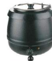
Electric Soup Kettle

Model: 83013SP Dimension: 13L Volts: 220V AC/50Hz Power: 600W