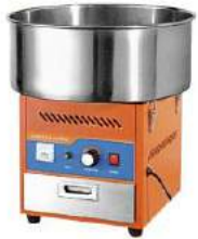
Electric Candy Floss Machine

Pink color and orange color are available. Adjustable temperature control. All Candy Floss Machines come with a dedicated sugar spoon. Over-temperature protection device.