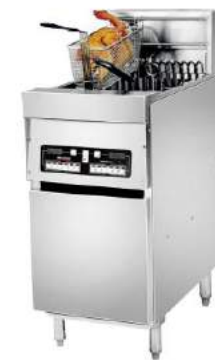
1-Tank 2-Basket Computer Fryer

Model: HEF-871 Dimension: 400x800x1125mm Capacity: 28L Volts: 3N-380V Hp: 18KW N/W: 40Kg