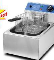
1-Tank 1-Basket Electric Fryer

Model: HEF-81A Dimension: 275x430x290mm Packing Size: 460x295x305mm Capacity: 6L Volts: 220V-240V/50-60Hz Power: 2.5KW N/W: 4.5Kg