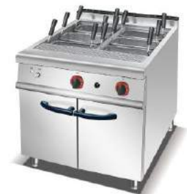
Gas Pasta Cooker With Cabinet

Model: HGN-915 Dimension: 800x900x920mm LPG2800-3700Pa: 1.58Kg/h NG2000-2500Pa: 2.28m 3 /h Power Supply: 22KW