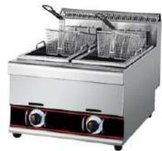
2-Tank 2-Basket Gas Fryer

Model: HGF-772 Dimension: 600x650x550mm Capacity: 12.5L+12.5L Power: 9KW/Hour N/W: 40Kg