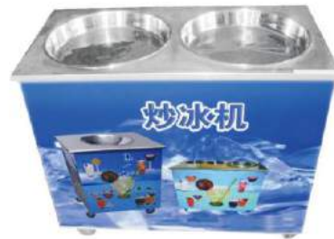
Fried Ice Cream Machine

Model: FIM-A30 Dimension: 830x440x700mm Volts: 220V/50Hz Power: 1.8KW Output: 25Kg/hour N/W: 60Kg