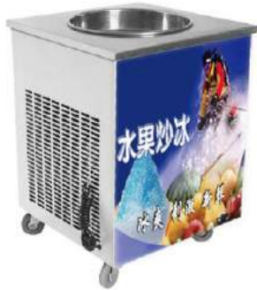
Fried Ice Cream Machine

Model: FIM-A15 Dimension: 535x535x700mm Volts: 220V/50Hz Power: 1.5KW Output: 13Kg/hour N/W: 38Kg