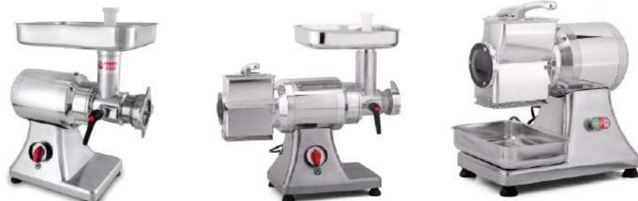
MG12MD/MG22MD/MG32MD Compact Commercial Meat Grinder