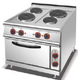
Electric 4-Hot-Plate Cooker With Oven

Model: HRQ-912A Dimension: 800x900x920mm Oven Dimensions: 560x700x270mm Volts: 380V