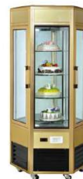
HCL-600L Cake Showcase