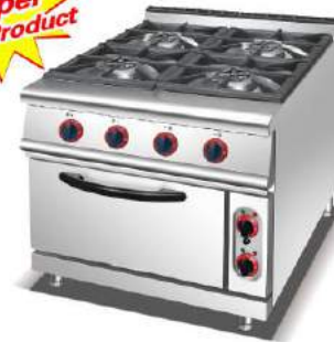
4-Burner Gas Range with Oven

Model: HGR-905/905A Dimension: 800x900x920mm Oven Dimensions: 460x645x270mm LPG2800-3700Pa: 2.62Kg/h NG2000-2500Pa: 3.70m 3 /h Power Supply: 7.8x4+5.8KW