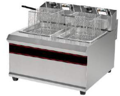
2-Tank 2-Basket Electric Fryer