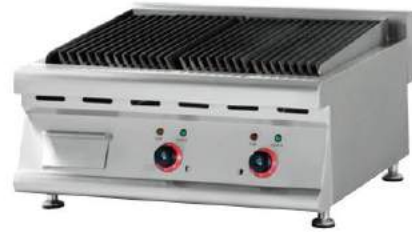
Counter Top Electric Lava Rock Grill

Model: HEL-607 Dimension: 650x600x350mm Volts: 220-240V/50-60Hz Hp: 7.2KW N/W: 43Kg