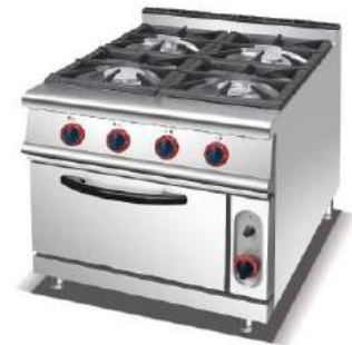
Gas 4-Burner Range With Gas/Electric Oven

Model: HGR-905B Dimension: 800x900x920mm LPG2800-3700Pa: 2.06Kg/h NG2000-2500Pa: 3.07m 3 /h Power Supply: 7.8x4KW