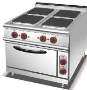
Electric 4 Hot-plate Cooker With Oven(Square)

Model: HSQ-962B Dimension: 1200x900x920mm Oven Dimensions 560x700x270mm Volts: 380V Power Supply: 4x6+4.8KW