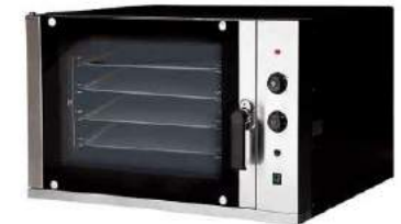
Electric Convection Oven

Model: HE0-07 Dimension: 680x650x620mm Volts: 220V/50Hz Power: 3.15KW N/W: 45Kg