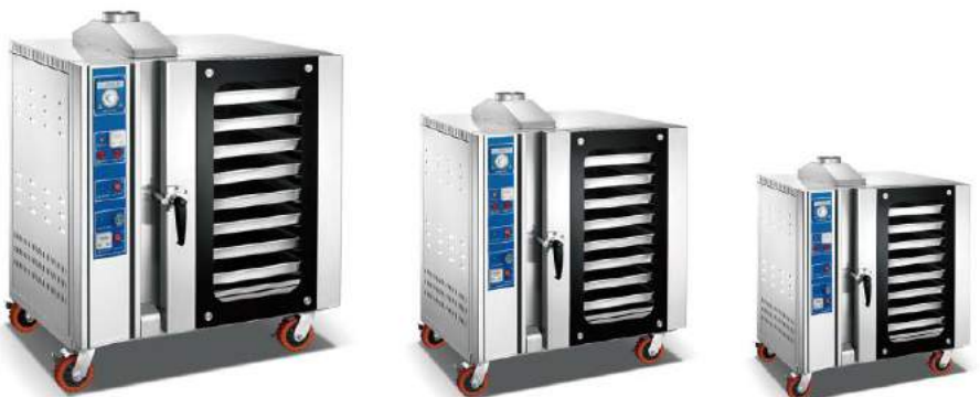
Gas Convection Oven