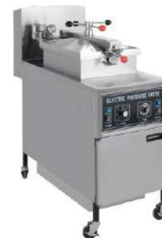
Electric Pressure Fryer

Model: MDXZ-24 Dimensions: 460x960x1230mm Packing Size: 1030x510x1300mm Capacity: 24L Volts: 3N~380V/50Hz Power: 14.2KW N/W: 110Kg For 4-6 Chickens