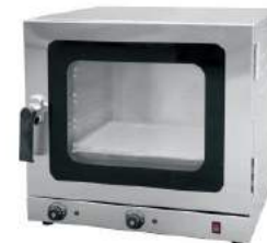
Electric Convection Oven

Model: FJ-32 Dimension: 1000x690x1860mm Volts: 220V/50Hz Power: 2.8KW Capacity: 32 Pans Production: 120Kg/Hour