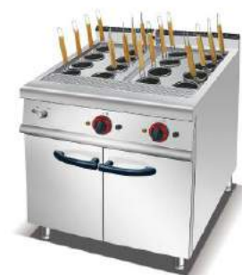
Electric Pasta Cooker With Cabinet

Model: HEN-910A Dimension: 800x900x920mm Volts: 380V Power Supply: 18KW