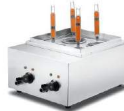
Counter Top Electric Pasta Cooker

Model: HEN-4A Dimension: 410x570x280mm Volts: 220-240V/50-60Hz Power: 4KW N/W: 13Kg