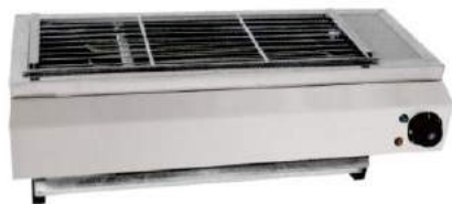
Electric Smokeless Barbecue Oven

Model: HBO-70 Dimension: 660x350x210mm Volts: 220-240V/50-60Hz Power: 3KW