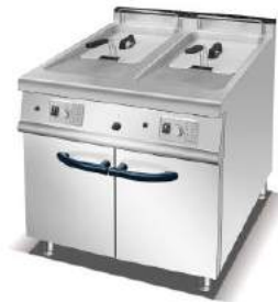
Gas 2-Tank Fryer With Cabinet

Model: HGF-908 Dimension: 800x900x920mm LPG2800-3700Pa: 2.46Kg/h NG2000-2500Pa: 3.12m 3 /h Power Supply: 32KW Capacity: (20± 2)x2L