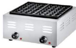
Electric 2-Head Fish Grill

Model: HX-34R Dimension: 270x470x260mm Gas: LPG Heating: 12053BTU/Hour N/W: 14Kg