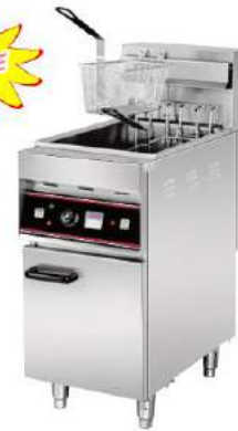
1-Tank 2-Basket Electric Fryer

Model: HEF-26 Dimension: 420x830x1080mm Capacity: 30L Volts: 380V Power: 10KW N/W: 38Kg