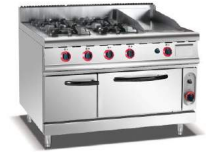
Gas Range 4-Burner Stove & Griddle & Oven

Model: HGR-9052B Dimension: 800x900x920mm LPG2800-3700Pa: 1.73Kg/h NG2000-2500Pa: 2.33m 3 /h Power Supply: 7.5x2+4.5x2KW