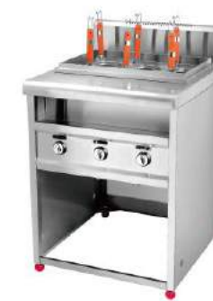
Gas Pasta Cooker

Model: HEN-4HX Dimension: 430x690x950mm Gas: LPG or Natural Gas Power: 56500BTU/Hour N/W: 20Kg