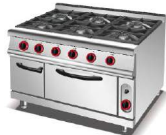
Gas 6-Burner Range With Gas Oven