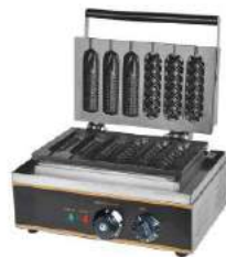
Corn & Hot Dog Waffle Maker

Model:HX-111 Dimension: 390x340x245mm Packing Size:435x410x305mm Volts:220-240V/50-60Hz Power:1.55KW N.W.:9.5Kg G.W.:10.5Kg Single Pie Size: 140xØ40mm Cake Depth:15mm