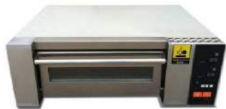
Digital Control Baking Oven

Model: HEO-11B(1-Deck-1-Tay) Machine Size: 960x970x320mm Volts: 220-240V/380V Power: 3.2KW