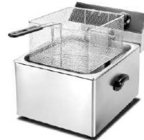
1-Tank 1-Basket Electric Fryer

Model: HEF-11L Dimension: 370x440x340mm Packing Size: 470x350x360mm Volts: 220V-240V/50-60Hz Power: 3.2KW N/W: 11.4Kg