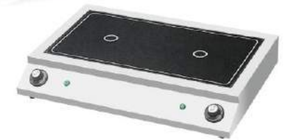
2-Head Induction Oven

Model: HP-2000 Dimension: 350x420x100mm Volts: 220V/50Hz Power: 2KW N/W: 5Kg