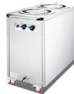
2-Head Electric Plate Warmer Cart

Model: HPW-1 Dimension: 450x570x900mm Volts: 220-240V/50-60Hz Power: 0.4KW