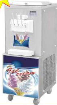
Ice Cream Machine

Model: HIM-02 Dimension: 700x900x1435mm Volts: 220-240V/50-60Hz Power: 1.7KW Output: 11-16Kg/Hour(18-25L) Refrigerant: R22/R404A N/W: 135Kg