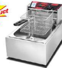
1-Tank 1-Basket Electric Fryer

Model: HEF-81 Dimension: 285x450x310mm Packing Size: 480x315x325mm Capacity: 6L Volts: 220-240V/50-60Hz Power: 2.5KW N/W: 4.6Kg