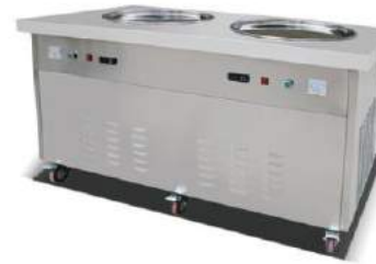
Roller Ice Cream Machine

Model: FIR-PF1R(Square Type) Dimension: 65x65x88cm Packing Size: 70x70x93cm Volts: 220V/50HZ Power: 2.2KW N.W.: 48KGS G.W.: 53KGS