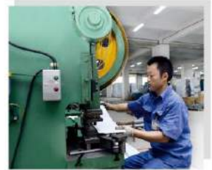
Profession Enhance Competitiveness