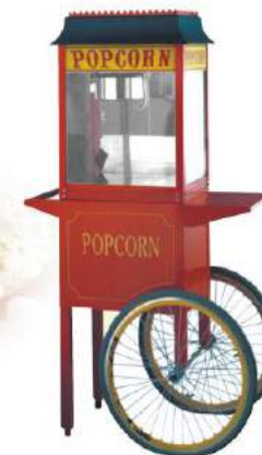
Popcorn Machine with Cart

Model: HP-800C Dimension: 800x470x1540mm Volts: 220-240V/50-60Hz Power: 1.44KW