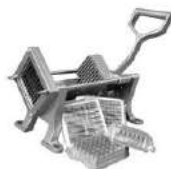
Vegetable & Fruit Cutter

Model: HWM-550 Dimension: 550x660x155mm Volts: 220V/50HZ Power: 0.21KW N/W: 7Kg