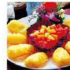
Counter Top 2-Tank 2-Basket Gas Fryer

Model: HGF-608 Dimension: 800x612x470mm Capacity: 8L+8L Hp: 40.4MJ Valve Type: Low-pressure Valve Butners: 2 N/W: 29Kg