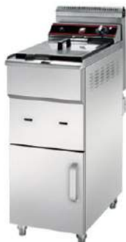
1-Tank 1-Basket Gas Fryer

Model: HGF-181C Dimension: 345x585x1025mm Capacity: 18L Gas: LPG or Natural Gas N/W: 25Kg