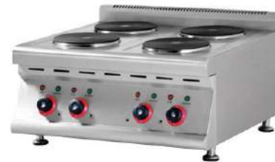
Counter Top 4-Burner Electric Cooker

Model: HGL-610 Dimension: 600x600x480mm Hp: 26MJ Valve Type: Low-pressure Valve Butners: 1 N/W: 25Kg