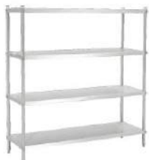
Food Storage Rack