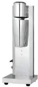
Milk Shaker (1-Head)

Model: HBL-015 Dimension: 230x250x570mm Volts: 220-240V/50-60HZ Power: 0.3KW