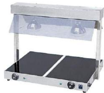
Electric Warming Tray

Model: HTC-2F Dimension: 730x580x550mm Volts: 220-240V/50-60Hz Power: 0.8KW Weight: 14Kg