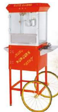
Popcorn Machine with Cart

Model: HP-800C Dimension: 800x470x1540mm Volts: 220-240V/50-60Hz Power: 1.44KW