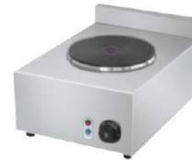
Single Induction Cooker

Model: HSC-2203 Dimension: 520x360x250mm Volts: 220-240V/50-60Hz Power: 2.6KW N/W: 6.5Kg