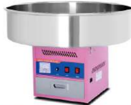
Electric Candy Floss Machine

Model: HEC-03 Dimension: 460x460x500mm Volts: 220-240V/50-60Hz Power: 0.93KW