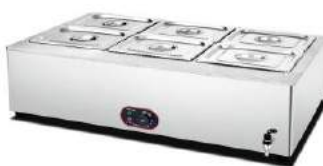
Electric Bain Marie

Model: HB-4V Dimension: 700x600x280mm Volts: 220-240V/50-60Hz Power: 1.5KW N/W: 16.5Kg