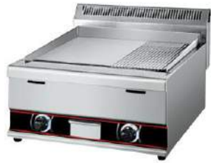
Gas Griddle (1/3 Grooved)

Model: HGG-752 Dimension: 760x650x550mm Gas: LPG or Natural Gas Power: 16KW/Hour N/W: 70Kg