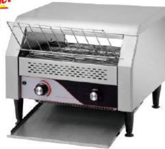
Electric Conveyor Toaster

Model: HET-150 Dimension: 560x320x200mm Packing Size: 510x380x380mm Volts: 220-240V/50-60Hz Power: 1.3KW N/W: 12Kg G.W: 14Kg Model: HET-300 Dimension: 560x385x200mm Packing Size: 510x440x380mm Volts: 220-240V/50-60Hz Power: 2.2KW N/W: 13.2Kg G.W: 16Kg Model: HET-450 Dimension: 560x460x200mm Packing Size: 510x540x380mm Volts: 220-240V/50-60Hz Power: 2.6KW N/W: 30.5Kg G.W: 33.5Kg