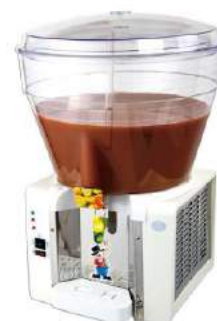
LSP50L Juice Dispenser