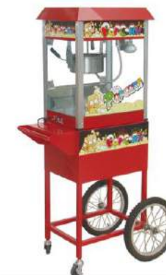
Popcorn Machine with Cart

Model: HP-BC Dimension: 940x450x1540mm Volts: 220-240V/50-60Hz Power: 1.44KW