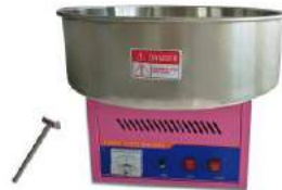
Electric Candy Floss Machine

Model: HEC-03N Dimension: 520X520X300mm Packing Size: 53x53x32mm Volts: 220-240V/50-60Hz Power: 0.93 KW