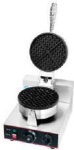
1-Plate Waffle Baker

Model: HWB-1 Dimension: 250x350x260mm Volts: 220-240V/50-60Hz Power: 1KW N/W: 5.4Kg