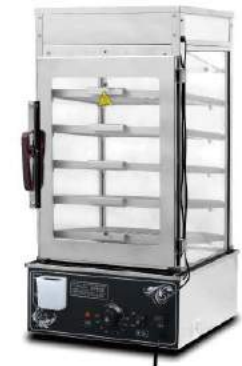
Food Display Warmer

Model: HW-500H Dimension: 380x420x760mm Volts: 220~240V/50~60Hz Power: 1.2KW N/W: 24Kg