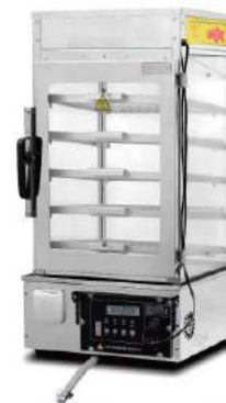
Food Display Warmer (Touch Screen)

Model: HW-805 Dimension: 865x360x825mm Volts: 220V-240V/50-60Hz Power: 1.5KW Weight: 60Kg