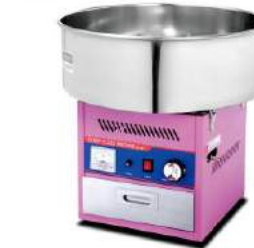
Gas Candy Floss Machine

Model: HGC-03 Dimension: 460x460x500mm Volts: 220-240V/50-60Hz Power: 1KW/h+0.08KW