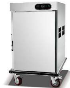
Food Warmer Cart

Model: HW-11-5F Dimension: 790x970x1350mm Inner Size: 540x680x940mm Volts: 220-240V Power: 2.62KW Layer Distance: 160mm Layer Number: 5-layer