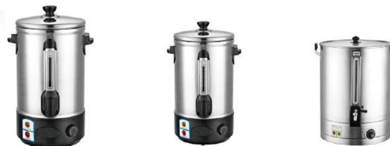
WB-10/15/25/30/35/40 Double-Layer Water Boiler(Heat & Warm) WB-20A/30A/40A/55A Single-Layer Water Boiler(Heat) WB-30B/40B Single-Layer Water Boiler(Heat)