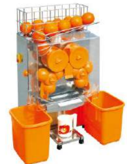
Auto Orange Juicer

Model: 1000KP Size: 345x32x380mm Power: 220V/50Hz HP: 0.37KW Speed: 2800r/min Output: 5Kg/min N/W: 15Kg Model: 2000KP Size: 420x360x510mm Power: 220V/50Hz HP: 0.55KW Speed: 2800r/min Output: 10Kg/Min N/W: 28Kg