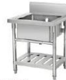
Single Sink Bench