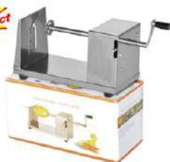
Tomato Potato Cutter

Model: HSP-01 Dimension: 450x150x180mm N/W: 2.5Kg