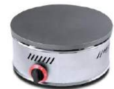
1-Plate Gas Crepe Maker

Model: HCM-400 Dimension: 400x400x190mm Volts: 220V/50Hz Power: 2.2KW N/W: 20Kg