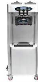
Soft Ice Cream Machine

Model: HIM-18 Dimension: 900x700x1435mm Volts: 220-240V Power: 1.7KW Output: 28-38L Refrigerant: R22 N/W: 138Kg Model: HIM-28 Dimension: 900x700x1435mm Volts: 380V Power: 3.4KW Output: 43-52L Refrigerant: R404A N/W: 168Kg