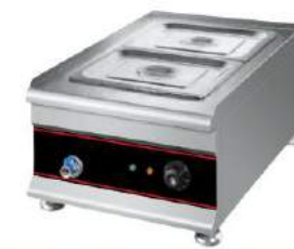
Electric Bain Marie

Model: HB-906 Dimension: 615x560x380mm Volts: 220-240V/50-60Hz Power: 1.6KW N/W: 25Kg