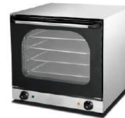
Electric Convection Oven

Model: HEO-24B(2-Deck-4-Tay) Machine Size: 1330x815x1320mm Volts: 220-240V/380V Power: 13W