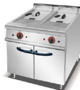
Electric 2-Tank Fryer With Cabinet

Model: HEF-908A Dimension: 800x900x920mm Volts: 380V Power Supply: 24KW Capacity: (28± 2)x2L