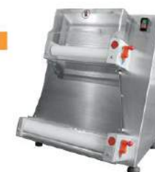
Pizza Dough Sheeter

Model: APD30 (Automatic) Dimensions: 530x480x560mm Power: 0.37KW Volts: 220V/50Hz Dough Weight: 50-500g Pizza Diameter: 30cm N/W: 37Kg