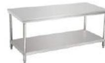
Work Table With Under Shelf