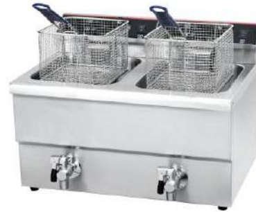
2-Tank 2-Basket Electric Fryer