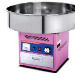
Gas Candy Floss Machine

Model: HGC-03 Dimension: 460x460x500mm Volts: 220-240V/50-60Hz Power: 1KW/h+0.08KW