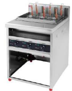
Electric Pasta Cooker

Model: HGN-6HX Dimension: 600x690x950mm Gas: LPG or Natural Gas Power: 84750BTU/Hour N/W: 31Kg