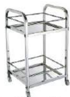
Assembled bar trolley