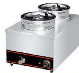
Table Top Bain Marie

Model: HB-6V Dimension: 700x600x280mm Volts: 220-240V/50-60Hz Power: 1.5KW N/W: 19Kg