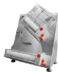
Pizza Dough Sheeter

Model: APD30 (Automatic) Dimensions: 530x480x560mm Power: 0.37KW Volts: 220V/50Hz Dough Weight: 50-500g Pizza Diameter: 30cm N/W: 37Kg