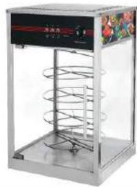
Pizza Display Warmer

Model: HW-815 Dimension: 490x490x810mm Volts: 220-240V/50-60HZ Power: 0.65KW Weight: 15Kg