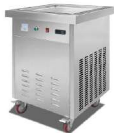
Roller Ice Cream Machine

Model: FIR-PF1R(Round Type) Dimension: 65x65x88cm Packing Size: 70x70x93cm Volts: 220V/50HZ Power: 2.2KW N.W.: 48KGS G.W.: 53KGS