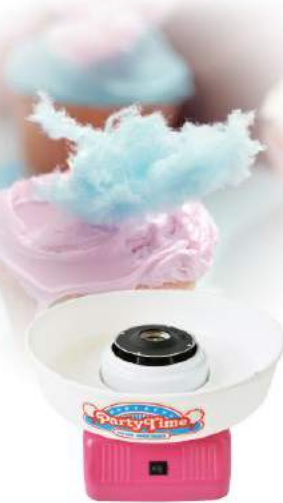
Electric Candy Floss Machine

Model: HGC-04 Dimension: 730x730x500mm Volts: 220-240V/50-60Hz Power: 1KW/h+0.08KW