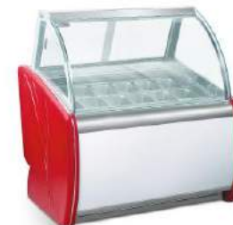
BQG-1200 BQG-1500 BQG-1800 Ice Cream Show Case