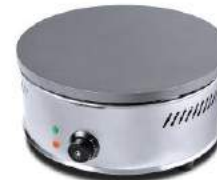
1-Plate Electric Crepe Maker

Model: HCM-2G Dimension: 860x470x230mm Gas: LPG Power: 8KW/Hour N/W: 44Kg