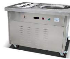
Roller Ice Cream Machine

Model: FIR-PF2R-6C Dimension: 156x65x88cm Packing Size: 161x70x93cm Volts: 220V/50HZ Power: 4.2KW N.W.: 106KGS G.W.: 122KGS