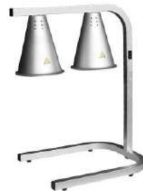
Infrared Warm lamp

Model: HW-819A (1-Lamp) Dimension: 580x430x330mm Volts: 220-240V/50-60Hz Power: 0.25KW