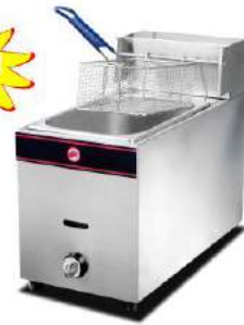
1-Tank 1-Basket Gas Fryer

Model: HGF-71 Dimension: 290x520x480mm Capacity: 6L Power: 18.9TU/hr N/W: 10.8Kg