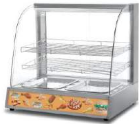
Food Display Warmer

Model: HW-2PS Dimension: 660x480x630mm Volts: 220~240V/50~60Hz Power: 0.8KW N/W: 21Kg