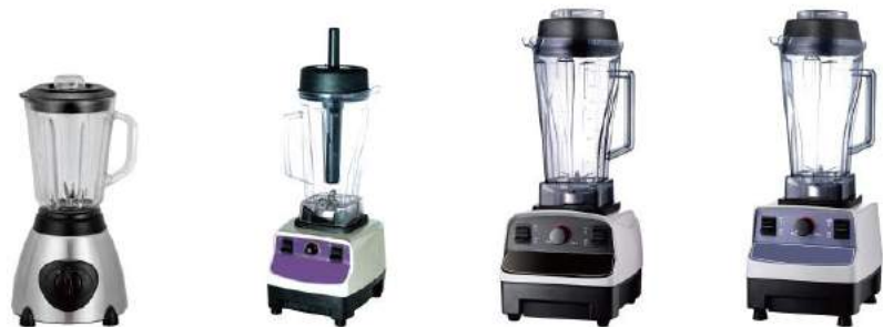
CB-168 Commercial Blender CB-767 Commercial Blender CB-787 Commercial Blender CB-768A Commercial Blender