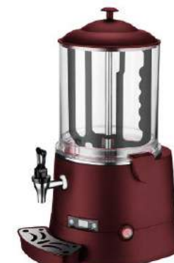
CH10L CH10L Hot Chocolate Machine