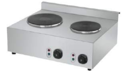
Double Induction Cooker

Model: HSC-2203 Dimension: 520x360x250mm Volts: 220-240V/50-60Hz Power: 2.6KW N/W: 6.5Kg