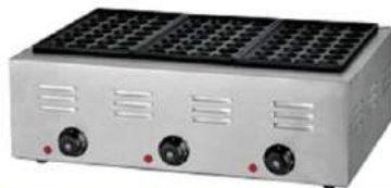
Electric 3-Head Fish Grill

Model: HX-56R Dimension: 470x470x260mm Gas: LPG Heating: 26700BTU/Hour N/W: 28Kg