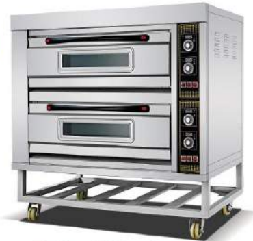
Rack need to be order separate