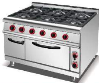
Gas 6-Burner Range With Electric Oven

Model: HGR-776 Dimension: 1050x750x920mm Oven Dimensions: 560x600x270mm LPG2800-3700Pa: 3.55Kg/h NG2000-2500Pa: 5.26m 3 /h Power Supply: 7.8x6+5.8KW