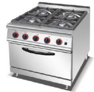
4-Burner Gas Range with Oven

Model: HGR-905/905A Dimension: 800x900x920mm Oven Dimensions: 460x645x270mm LPG2800-3700Pa: 2.62Kg/h NG2000-2500Pa: 3.70m 3 /h Power Supply: 7.8x4+5.8KW