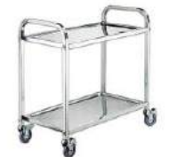
2 Tiers assembled dining cart