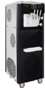
Soft Ice Cream Machine

Model: HIM-06 Dimension: 733x530x828mm Voltage: 220V/50Hz Power: 2000W Compressor Power: 1HP Compressor: LG or Embraco Coolant: R22 or R404a Tank Capacity: 2x6.5L Stainless Steel(non Magnetic)Case+Ti/Steel Single System