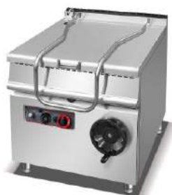
Gas Tilting Braising Pan

Model: HGZ-911 Dimension: 400x900x920mm LPG2800-3700Pa: 0.71Kg/h NG2000-2500Pa: 1.0m 3 /h Power Supply: 10KW