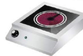
1-Head Induction Oven

Model: HSC-2205 Dimension: 610x520x250mm Volts: 220-240V/50-60Hz Power: 2+2.6KW N/W: 10Kg