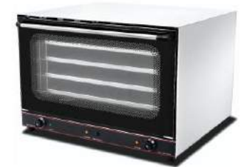
Electric Convection Oven

Model: HEB-4F Dimension: 595x600x580mm Volts: 220V/50Hz Power: 2.6KW N/W: 39Kg