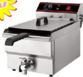
1-Tank 1-Basket Electric Fryer