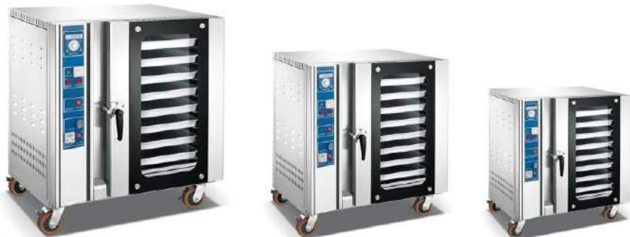
Electric Convection Oven