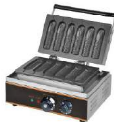
Six Corn Waffle Maker

Model:HX-229 Dimension: 390x340x245mm Packing Size:435x410x305mm Volts:220-240V/50-60Hz Power:1.55KW N.W.:9.5Kg G.W.:10.5Kg Single Pie Size: 140xØ40mm Cake Depth:15mm