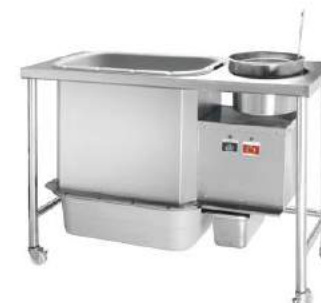
Electric Breading Table

Model: HBT-1000 Dimension: 1000x700x800(950)mm