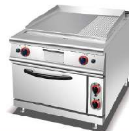
Electric Griddle (1/3Grooved) With Electric Oven

Model: HER-913A Dimension: 800x900x920mm Griddle Size: 725x610x20mm Oven Dimensions: 560x700x270mm Volts: 380V Power Supply: 12+4.8KW