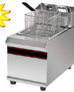
1-Tank 1-Basket Electric Fryer