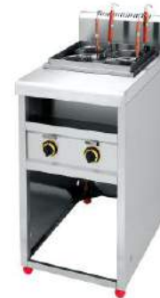
Gas Pasta Cooker

Model: HEN-4HX Dimension: 430x690x950mm Gas: LPG or Natural Gas Power: 56500BTU/Hour N/W: 20Kg