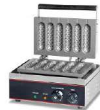
6 Sticks Waffle Stick Maker

Model: HX-117 Dimension: 360x330x245mm Packing Size: 360x330x245mm Volts: 220-240V/50-60Hz Power: 1.55KW N.W.: 9Kg G.W.: 10Kg Single Pie Size: 140x40mm Cake Depth: 15mm