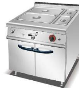
Gas Bain Marie With Cabinet

Model: HGN-715 Dimension: 700x750x920mm LPG2800-3700Pa: 1.58Kg/h NG2000-2500Pa: 2.28m 3 /h Power Supply: 22KW