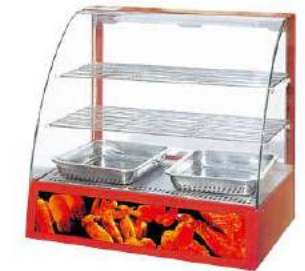
Food Display Warmer

Model: HW-2P Dimension: 660x480x630mm Volts: 220-240V/50-60Hz Power: 0.8KW N/W: 21Kg