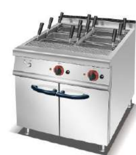
Electric Pasta Cooker With Cabinet

Model: HEN-710A Dimension: 700x750x920mm Volts: 380V Power Supply: 12KW