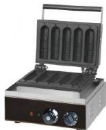
Five Corn Waffle Maker

Model:HX-229 Dimension: 390x340x245mm Packing Size:435x410x305mm Volts:220-240V/50-60Hz Power:1.55KW N.W.:9.5Kg G.W.:10.5Kg Single Pie Size: 140xØ40mm Cake Depth:15mm