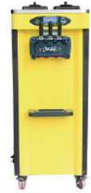
Soft Ice Cream Machine

Model: HIM-25DB Dimension: 715x560x1380mm Packing Size: 780x620x1480mm Volts: 220V/50Hz Hp: 1.8KW Out Put: 25L/H Refrigerant: R22/R404A Compressor: Panasonic Or Aspera