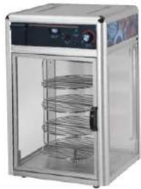
Pizza Warming Showcase

Model: HW-13 Dimension: 500x450x770mm Volts: 220V-240V/50-60Hz Power: 0.85KW Weight: 26Kg