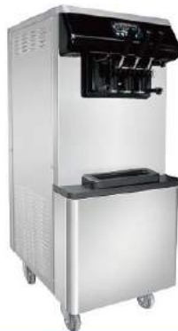
Ice Cream Machine

Model: HIM-02 Dimension: 700x900x1435mm Volts: 220-240V/50-60Hz Power: 1.7KW Output: 11-16Kg/Hour(18-25L) Refrigerant: R22/R404A N/W: 135Kg