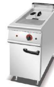
Electric 1-Tank Fryer With Cabinet

Model: HEF-708A Dimension: 700x750x920mm Volts: 380V Power Supply: 24KW Capacity: (23± 2)x2L