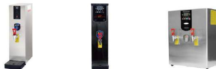
HB-10L Microcomputer Water Boiler HB-5L/20L/30L Microcomputer Water Boiler HB-30LA/40LA/60LA Microcomputer Water Boiler