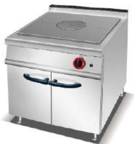
Gas Solid Top With Cabinet

Model: HGZ-911 Dimension: 400x900x920mm LPG2800-3700Pa: 0.71Kg/h NG2000-2500Pa: 1.0m 3 /h Power Supply: 10KW