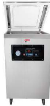
DZ400S DZ500S DZ600S