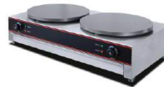
2-Plate Electric Crepe Maker

Model: HCM-2 Dimension: 860x470x230mm Volts: 220V/50Hz Power: 6KW N/W: 44Kg