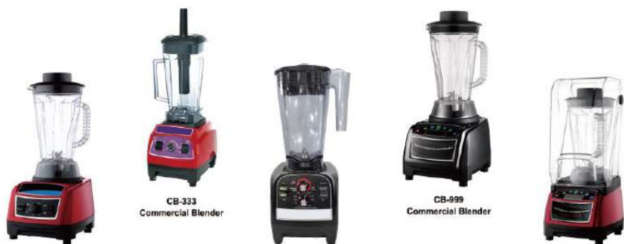
CB-966 Commercial Blender CB-333 Commercial Blender CB-666 Commercial Blender CB-999z Commercial Blender