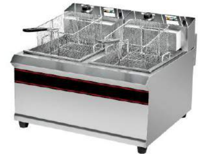
2-Tank 2-Basket Electric Fryer