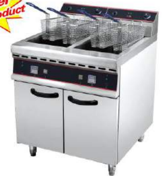
2-Tank 4-Basket Electric Fryer

Model: HEF-26-2 Dimension: 800x830x1080mm Capacity: 30L+30L Volts: 380V Power: 20KW N/W: 58Kg