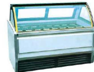
CD120BL CD150BL CD180BL Island Type Ice Cream Show Case