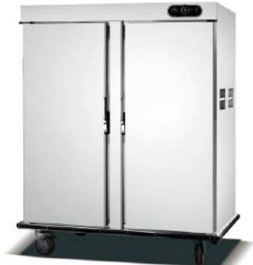
Food Warmer Cart

Model: HW-11-21 Dimension: 790x970x1750mm Inner Size: 540x680x1380mm Volts: 220-240V Power: 2.62KW Layer Distance: 115mm Layer Number: 11-layer