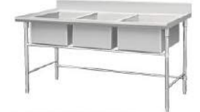
Economical Triple Sink Bench