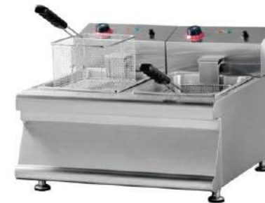
Counter Top 2-Tank 2-Basket Electric Fryer

Model: HGL-607 Dimension: 650x612x530mm Hp: 57.6MJ Valve Type: Low-pressure Valve Butners: 2 N/W: 49Kg