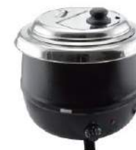
Electric Soup Kettle

Model: 81010SP Dimension: 10L Volts: 220V AC 50Hz Power: 400W