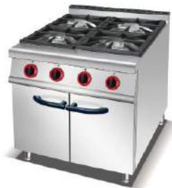
Gas 4-Burner Range With Cabinet