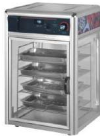
Food Display Warmer

Model: HW-13 Dimension: 500x450x770mm Volts: 220V-240V/50-60Hz Power: 0.85KW Weight: 26Kg