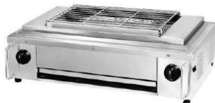
Gas Smokeless Barbecue Oven

Model: HBO-70 Dimension: 660x350x210mm Volts: 220-240V/50-60Hz Power: 3KW