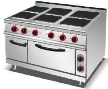
Electric 6 Hot-plate Cooker With Oven(Square)

Model: HEK-100 Dimension: 800x900x920mm Pressure: ≤ 50kpa Volts: 380V Power Supply: 18KW Capacity: 100L