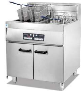
2-Tank 4-Basket Computer Fryer

Model: HEF-872 Dimension: 800x800x1125mm Capacity: 28L+28L Volts: 3N-380V Hp: 18+18KW N/W: 80Kg