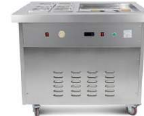
Roller Ice Cream Machine

Model: FIR-PF1R-6C(Round Type) Dimension: 100x65x88cm Packing Size: 105x70x93cm Volts: 220V/50HZ Power: 2.4KW N.W.: 68KGS G.W.: 76KGS