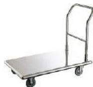
Assembled luggage cart