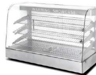
Food Display Warmer

Model: HW-863 Dimension: 900x455x580mm Volts: 220-240V/50-60Hz Power: 1.6KW N/W: 41Kg