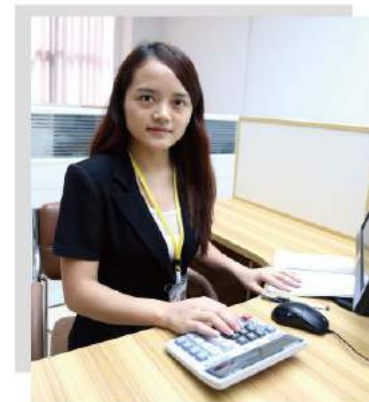
Monthly Top Sales