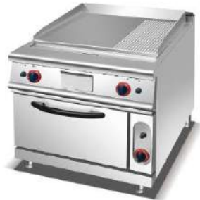
Gas Griddle (2/3Flat, 1/3Grooved) With Gas/Electric Oven

Model: HGR-913/913B Dimension: 800x900x920mm Griddle Size: 725x610x20mm Oven Dimensions: 560x700x270mm LPG2800-3700Pa: 1.25Kg/h NG2000-2500Pa: 1.77m 3 /h Power Supply: 11.8+5.8KW