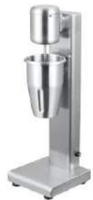
Milk Shaker (1-Head)

Model: HBL-018 Dimension: 340x270x510mm Volts: 220-240V/50-60HZ Power: 0.6KW