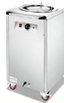
1-Head Electric Plate Warmer Cart

Model: HPW-1 Dimension: 450x570x900mm Volts: 220-240V/50-60Hz Power: 0.4KW