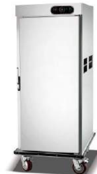
Food Warmer Cart

Model: HW-11-5F Dimension: 790x970x1350mm Inner Size: 540x680x940mm Volts: 220-240V Power: 2.62KW Layer Distance: 160mm Layer Number: 5-layer