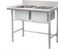
Economical Double Sink Bench