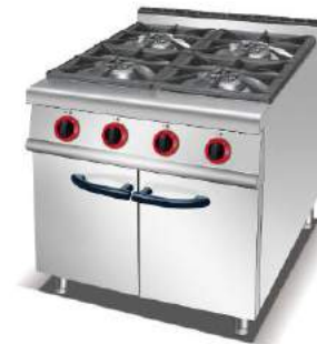
Gas 4-Burner Range With Cabinet

Model: HGR-705/705A Dimension: 700x750x920mm Oven Dimensions: 560x600x270mm LPG2800-3700Pa: 2.06Kg/h NG2000-2500Pa: 3.07m 3 /h Power Supply: 7.8x4+5.8KW