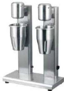
Milk Shaker (2-Head)

Model: HBL-11 Dimension: 190x160x530mm Volts: 220V/50HZ Hp: 1.5KW