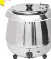
Stainless Steel Electric Soup Kettle

Model: 81010SP Dimension: 10L Volts: 220V AC 50Hz Power: 400W