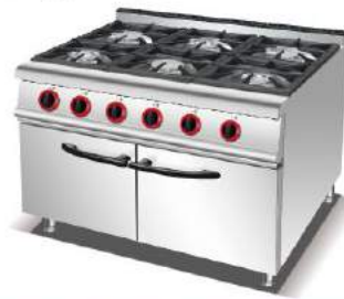
Gas 6-Burner Range With Cabinet