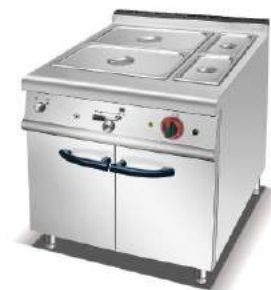
Electric Bain Marie With Cabinet

Model: HEB-909A Dimension: 800x900x920mm Volts: 380V Power Supply: 6KW