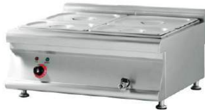
Counter Top Electric Pasta Cooker

Model: HEN-610 Dimension: 600x600x350mm Volts: 220-240V Power: 6KW Weight: 22.6Kg