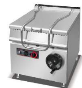
Electric Tilting Braising Pan

Model: HEB-709 Dimension: 700x750x920mm Volts: 380V Power Supply: 5KW