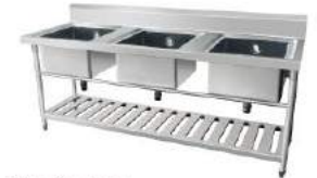
Triple Sink Bench