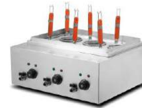
Counter Top Electric Pasta Cooker

Model: HEN-4A Dimension: 410x570x280mm Volts: 220-240V/50-60Hz Power: 4KW N/W: 13Kg