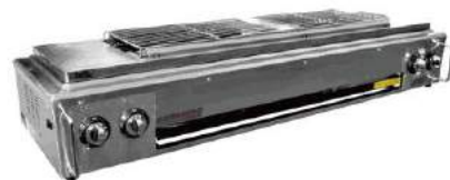
Gas Smokeless Barbecue Oven

Model: HBO-110 Dimension: 1100x370x210mm Volts: 220-240V/50-60Hz Power: 6KW