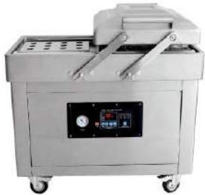
DZ400/2C DZ500/2C DZ600/2C