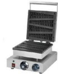
Lolly Waffle Maker

Model: HX-6 Dimension: 225x420x290mm Packing Size: 485x295x315mm Volts: 220-240V/50-60Hz Power: 1.415KW N.W.: 5.3Kg G.W.: 6.5Kg