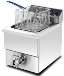
1-Tank 1-Basket Electric Fryer