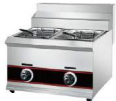
2-Tank 2-Basket Gas Fryer

Model: HGF-972 Dimension: 600x600x550mm Capacity: 8L+8L Power: 8KW/Hour N/W: 35Kg