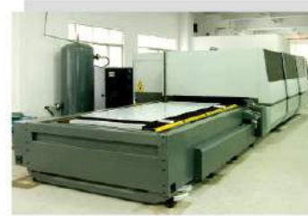
More Advanced Products