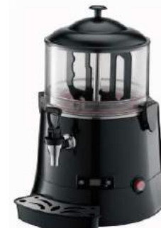
CH5L CH10L Hot Chocolate Machine