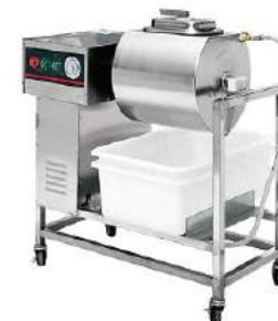
Vacuum Meat Sallting Machine

Model: HML-900 Dimension: 910x480x1030mm Volts: 220-240V/50-60Hz Power: 0.38KW N/W: 59Kg