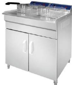
2-Tank 2-Basket Electric Fryer

Model: HEF-162C Dimension: 690x530x940mm Capacity: 16Lx2 Volts: 220-240V Power: 5KWx2 N/W: 33.5Kg