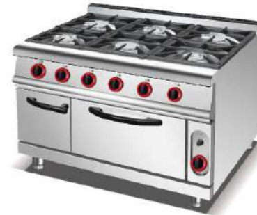
Gas 6-Burner Range With Gas/Electric Oven