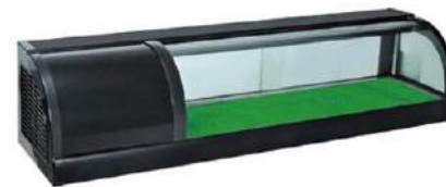
Sushi Display Cooler

Model: HW-11-21 Dimension: 1540x975x1795mm Inner Size: 1350x680x1380mm Volts: 220-240V Power: 2.62KW Layer Distance: 115mm Layer Number: 22-layer