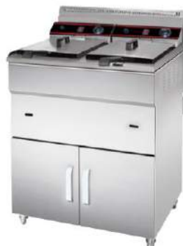
2-Tank 2-Basket Gas Fryer

Model: HGF-182C Dimension: 690x585x1025mm Capacity: 18x2L Gas: LPG or Natural Gas N/W: 50Kg