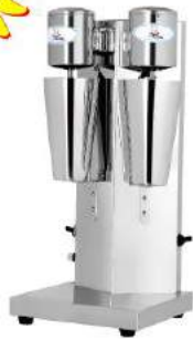
Milk Shaker (2-Head)

Model: HBL-015 Dimension: 230x250x570mm Volts: 220-240V/50-60HZ Power: 0.3KW