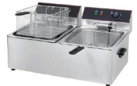
2-Tank 2-Basket Electric Fryer

Model: HEF-11L-2 Dimension: 725x440x345mm Packing Size: 700x470x360mm Volts: 220V-240V/50-60Hz Power: 2x3.2KW N/W: 15Kg