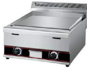
Gas Griddle (All Flat)

Model: HGG-753 Dimension: 760x650x550mm Gas: LPG or Natural Gas Power: 16KW/Hour N/W: 70Kg