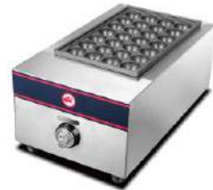
Gas 1-Head Fish Grill

Model: HX-34 Dimension: 270x470x260mm Volts: 220V/50Hz Power: 2KW N/W: 14Kg