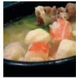
Counter Top Gas Pasta Cooker

Model: HGL-610 Dimension: 600x600x480mm Hp: 26MJ Valve Type: Low-pressure Valve Butners: 1 N/W: 25Kg