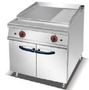
Gas Griddle (2/3 Flat&1/3 Grooved) with Cabinet

Model: HGR-996A Dimension: 1200x900x920mm Oven Dimensions: 560x700x270mm LPG2800-3700Pa: 3.34Kg/h NG2000-2500Pa: 4.85m 3 /h Power Supply: 7.8x6+5.8KW Voltage: 380V