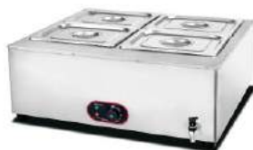
Electric Bain Marie

Model: HB-750 Dimension: 750x750x280mm Volts: 220-240V/50-60Hz Power: 3KW N/W: 18Kg