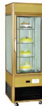
HCL-400L Cake Showcase