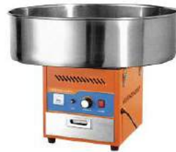
Electric Candy Floss Machine

Model: HEC-01 Dimension: 460x460x500mm Volts: 220-240V/50-60Hz Power: 0.93KW