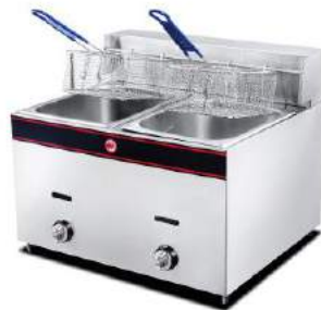
2-Tank 2-Basket Gas Fryer

Model: HGF-72 (2-Tank 2-Basket) Dimension: 570x520x480mm Capacity: 6L+6L Power: 37.8TU/hr N/W: 18.4Kg