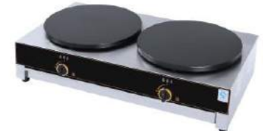
2-Plate Gas Crepe Maker

Model: HCM-2 Dimension: 860x470x230mm Volts: 220V/50Hz Power: 6KW N/W: 44Kg