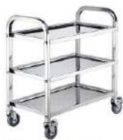
3 Tiers assembled dining cart