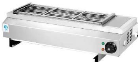
Electric Smokeless Barbecue Oven

Model: HBO-70G Dimension: 700x400x240mm Power: 19410BTU/hr