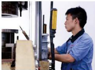
Brand The Market