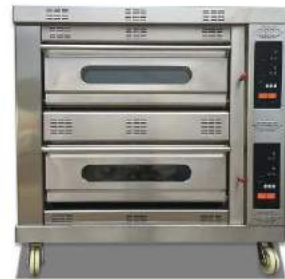
Digital Control Baking Oven

Model: HEO-11B(1-Deck-1-Tay) Machine Size: 960x970x320mm Volts: 220-240V/380V Power: 3.2KW