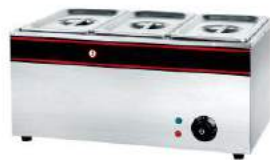
Electric Bain Marie

Model: HB-1080 Dimension: 1080x750x280mm Volts: 220-240V/50-60Hz Power: 3KW Weight: 28.2Kg