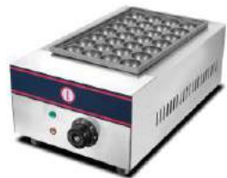
Electric 1-Head Fish Grill

Model: HX-34 Dimension: 270x470x260mm Volts: 220V/50Hz Power: 2KW N/W: 14Kg