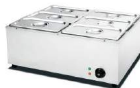
Electric Bain Marie

Model: HB-3V Dimension: 580x450x240mm Volts: 220-240V/50-60Hz Power: 1.5KW N/W: 10Kg