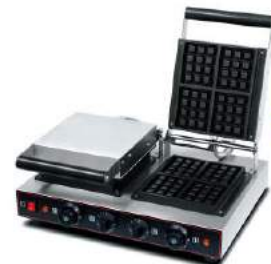
2-Plate Waffle Baker

Model: HWB-1S Dimension: 282x380x230mm Volts: 220-240V/50-60Hz Power: 1.6KW N/W: 11.6Kg