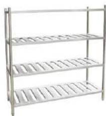
Food Storage Rack