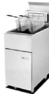
1-Tank 2-Basket Gas Fryer

Model: HGF-778 Dimension: 400x700x1100mm Capacity: 25L Gas: LPG or Natural Gas Power: 12KW/Hr N/W: 41Kg