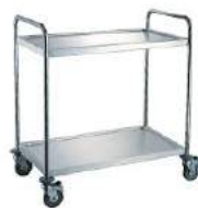
2 Tiers assembled dining cart