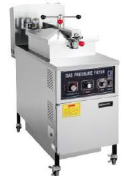
Gas Pressure Fryer

Model: MDXZ-25 Dimension: 460x960x1230mm Packing Size: 1030x510x1300mm Capacity: 25L Volts: 220V/50Hz Gas: LPG or Natural Gas Working Pressure: 0.085Mpa N/W: 110Kg