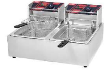
2-Tank 2-Basket Electric Fryer

Model: HEF-82 (2-Tank 2-Basket) Dimension: 570x450x310mm Packing Size: 620x470x325mm Capacity: 6L+6L Volts: 220-240V/50-60Hz Power: 2.5+2.5KW N/W: 8.6Kg