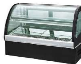
HW-848 Curved Cooling Showcase