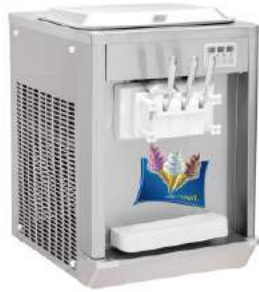
Ice Cream Machine

Model: HIM-01 Dimension: 570x740x750mm Volts: 220-240V/50-60Hz Power: 0.9KW Output: 8-11Kg/Hour(13-18L) Refrigerant: R22/R404A N/W: 59Kg