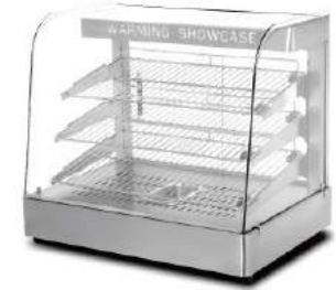
Food Display Warmer

Model: HW-862 Dimension: 650x455x580mm Volts: 220-240V/50-60Hz Power: 1.3KW N/W: 33Kg