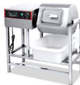
Meat Sallting Machine

Model: HML-900 Dimension: 910x480x1030mm Volts: 220-240V/50-60Hz Power: 0.38KW N/W: 59Kg