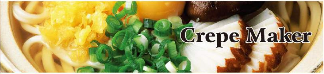
1-Plate Electric/Gas Crepe Maker

Model: HET-150 Dimension: 560x320x200mm Packing Size: 510x380x380mm Volts: 220-240V/50-60Hz Power: 1.3KW N/W: 12Kg G.W: 14Kg Model: HET-300 Dimension: 560x385x200mm Packing Size: 510x440x380mm Volts: 220-240V/50-60Hz Power: 2.2KW N/W: 13.2Kg G.W: 16Kg Model: HET-450 Dimension: 560x460x200mm Packing Size: 510x540x380mm Volts: 220-240V/50-60Hz Power: 2.6KW N/W: 30.5Kg G.W: 33.5Kg