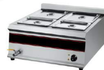
Electric Bain Marie

Model: HB-2T Dimension: 430x680x280mm Volts: 220-240V/50-60Hz Power: 1.6KW N/W: 12Kg