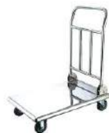
S/S luggage cart