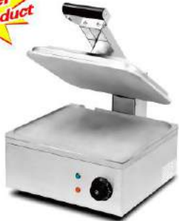
9-Slice Toaster(San Blast Finish)

Model: HT-01 Dimension: 540x400x290mm Volts: 220-240V/50-60Hz Power: 2.2KW N/W: 12Kg