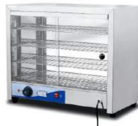
Food Display Warmer

Model: HW-14 Dimension: 550x450x770mm Volts: 220V-240V/50-60Hz Power: 0.85KW Weight: 38Kg