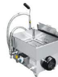
Shortening Filter Cart

Model: HBT-1200 Dimensions: 1200x750x1100mm Volts: 220-240V/50Hz Power: 0.18KW N/W: 60Kg