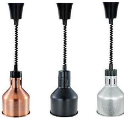
Bronze Black Silver

Model: A032 Power: 220V/250W Diameter: 175mm Adjustable Height: 0.6~1.8m