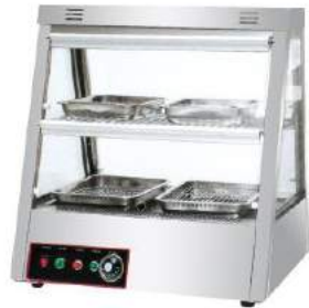
Food Display Warmer

Model: HW-2x2 Dimension: 700x655x730mm Volts: 220-240V/50-60Hz Power: 0.7KW N/W: 27Kg