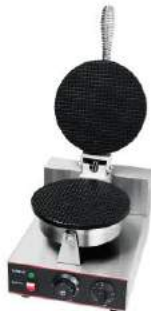
1-Plate Cone Baker

Model: HWB-2 Dimension: 500x350x260mm Volts: 220-240V/50-60Hz Power: 2KW N/W: 10.4Kg