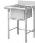
Economical Single Sink Bench