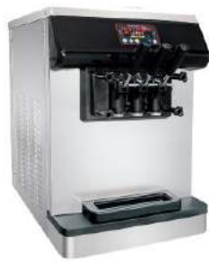
Ice Cream Machine

Model: HIM-03 Dimension: 800x700x840mm Volts: 220-240V/50-60Hz Power: 1.7KW Output: 11-16Kg/Hour(18-25L) Refrigerant: R22/R404A N/W: 108Kg