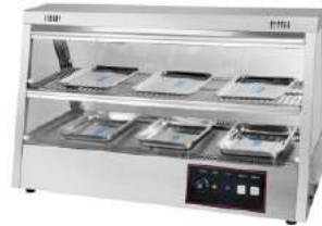
Food Display Warmer

Model: HW-2x3 Dimension: 1100x655x730mm Volts: 220-240V/50-60Hz Power: 1KW N/W: 35Kg