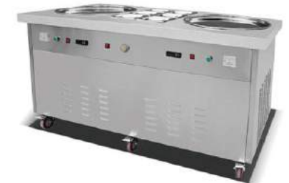
Roller Ice Cream Machine

Model: FIR-PF2R(Round Type) Dimension: 130x65x88cm Packing Size: 135x70x93cm Volts: 220V/50HZ Power: 4KW N.W.: 88KGS G.W.: 98KGS