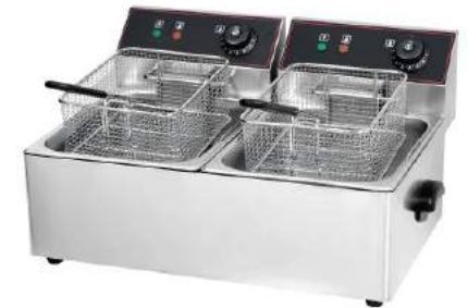
2-Tank 2-Basket Electric Fryer

Model: HEF-8L-2 Dimension: 592x410x340mm Packing Size: 590x450x380mm Volts: 220V-240V/50-60Hz Power: 2x2.8KW N/W: 11Kg