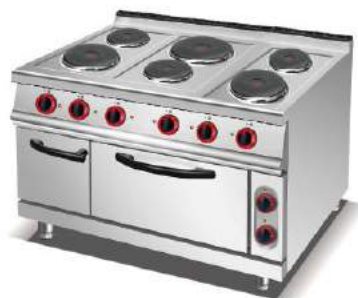
Electric 6-Hot-Plate Cooker With Oven

Model: HEN-715A Dimension: 700x750x920mm Volts: 380V Power Supply: 12KW