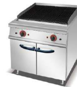
Electric Lava Rock Grill With Cabinet

Model: HEL-907A Dimension: 800x900x920mm Volts: 380V Power Supply: 12KW