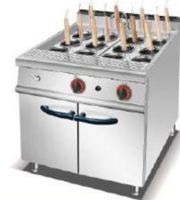
Gas Pasta Cooker With Cabinet

Model: HGF-910 Dimension: 800x900x920mm LPG2800-3700Pa: 1.58Kg/h NG2000-2500Pa: 2.28m 3 /h Power Supply: 22KW