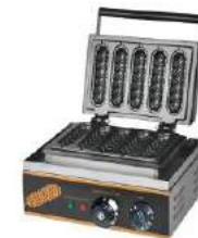
5 Sticks Waffle Stick Maker

Model: HX-220B Dimension: 410x305x240mm Packing Size: 450x350x280mm Volts: 220-240V/50-60Hz Power: 1.75KW N.W.: 12.2Kg G.W.: 13.5Kg Single Pie Size: 225x60x15mm Cake Depth: 30mm