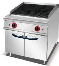
Gas Lava Rock Grill with Cabinet

Model: HGL-907 Dimension: 800x900x920mm LPG2800-3700Pa: 1.20Kg/h NG2000-2500Pa: 1.75m 3 /h Power Supply: 17KW