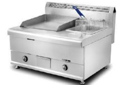
Electric Griddle With Gas/Electric Fryer

Model: HEG-848 Dimension: 1215x620x360mm Volts: 220-240V/50Hz-60Hz Power: 16KW N/W: 130Kg