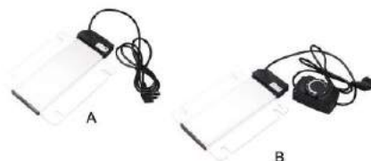
Electric Heat board

Model: 301129 Machine Size: 600x350x320MM Packing Size: 610x360x240MM