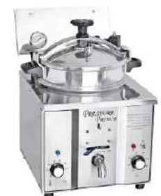
Electric Pressure Fryer

Model: MDXZ-16 Dimensions: 350x400x500mm Packing Size: 430x500x540mm Capacity: 16L Volts: 220V/50Hz Power: 3KW N/W: 18Kg For 2-3 Chickens