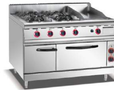
Gas Range 4-Burner Stove & Griddle & Electric Oven