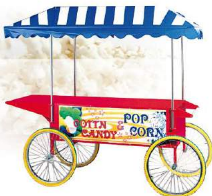
Popcorn Machine Cart

Model: HP-LC Dimension: 2070x760x2070mm Packing Size: 2080x860x680mm