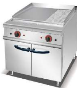
Electric Griddle (2/3Flat&1/3Grooved) With Cabinet

Model: HGK-100 Dimension: 800x900x920mm LPG2800-3700Pa: 1.78Kg/h NG2000-2500Pa: 2.58m 3 /h Pressure: 25kpa Capacity: 100L Power Supply: 61000BTU