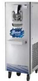
Hard Ice Cream Machine

Model: HIM-05 Machine: 540x780x1400mm Packing: 630x835x1540mm Volts: 220-240V/50-60Hz Power: 2.5KW Output: 28-38L/Hour Refrigerant: R22/R404A N/W: 162Kg