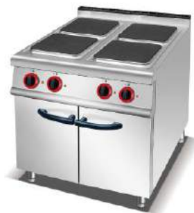
Electric 4 Hot-plate Cooker With Cabinet(Square)

Model: HSQ-912B Dimension: 800x900x920mm Oven Dimensions 560x700x270mm Volts: 380V Power Supply: 4x4+4.8KW