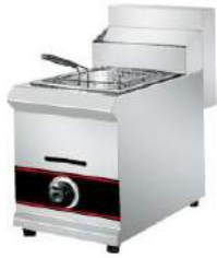
1-Tank 1-Basket Gas Fryer

Model: HGF-971 Dimension: 300x600x550mm Capacity: 8L Power: 4KW/Hour N/W: 22Kg