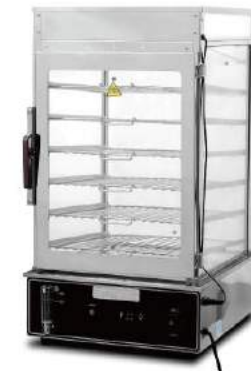
Food Display Warmer

Model: HW-600H Dimension: 480x540x840mm Volts: 220~240V/50~60Hz Power: 1.6KW N/W: 36Kg