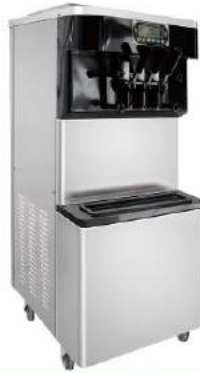
Ice Cream Machine

Model: HIM-04 Machine: 570x780x1400mm Packing: 630x835x1540mm Volts: 220-240V/50-60Hz Power: 2.2KW Output: 28-38L/Hour Refrigerant: R22/R404A N/W: 138Kg