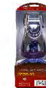
PART #: JTPH044 1" X 15' RATCHET TIE DOWN Break strength: 1,800 LBS Working Load Limit: 600 LBS Hook: Heat treated & vinyl coated S hooks