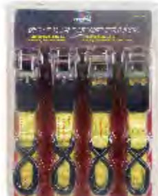
PART # - JIB0036