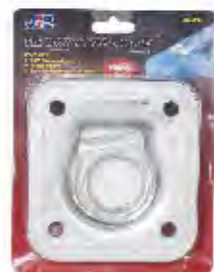
PART # - JIB0033