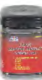
PART #: JBGB009