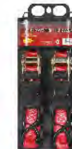
PART #: JTPH042 1" X 15' RATCHET TIE DOWN Break strength: 1,500 LBS Working Load Limit: 500 LBS Hook: Heat treated & vinyl coated S hooks