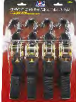
PART # - JIB0040