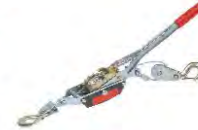
PART #: JIB-1TB2