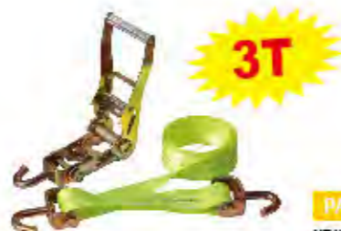
PART #: JTDB003-1 HEAVY DUTY CARGO LASHINGS