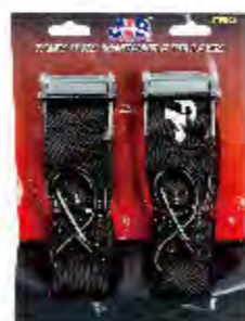
PART #: JTPB021 50MM X 3M CAMBUCKLE TIE DOWN ► Break strength: 750kgs