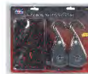
PART #: JIB0029