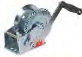
PART #: JIB-W1600