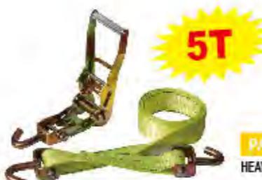
PART #: JTDB003-2 HEAVY DUTY CARGO LASHINGS