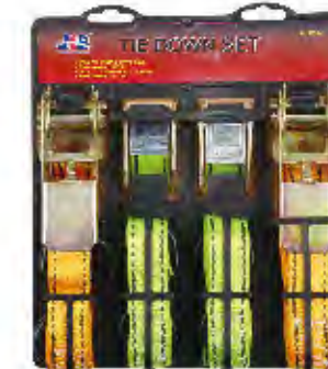
PART # - JTPH102

2PCS 1' X 10' RATCHET TIE DOWN Break strength: 1500 lbs Hook: heat treated & vinyl coated S hooks