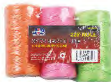
PART #: JTSP017