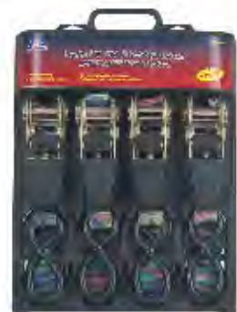
PART #: JTPH056

4PC 1" X 8" CAMBUCKLE TIE DOWN SET Break strength: 1,200 LBS Working Load Limit: 400 LBS Hook: Heat treated & vinyl coated S hooks