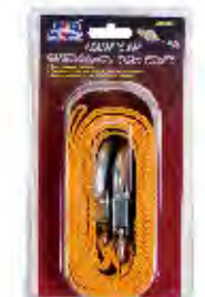
PART #: JTDC028 1.8" X 10' EMERGENCY TOW ROPE Break strength: 4,400 LBS Working Load Limit: 1,467 LBS