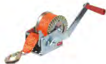
PART #: JIB-S800