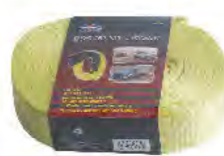
PART #: JTSP006 50mm x 6m TOW STRAP ► Break strength: 17,000 LBS