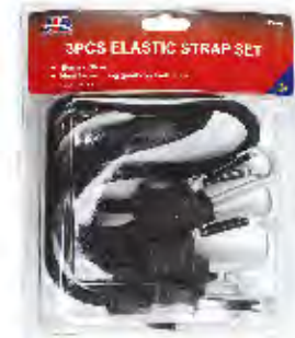
PART #: JIB0009

3PC 10MM X 24" CARABINER STYLE BUNGEE CORDS ▶ Super strong steel clipper hooks ▶ Anti-slip rubberized grip ▶ Spring gate looks secure