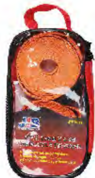
PART #: JTPB011 2PCS 25MM X 2.5M CAMBUCKLE TIE DOWN ► Belt material: polypropylene ► Break strength: 300 kgs ► Packing: zipper bag + Insert card