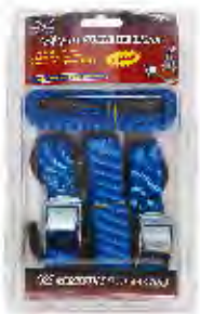
PART #: JTDC022 1" X 12' CAMBUCKLE TIE DOWN Break strength: 900 LBS Working Load Limit: 300 LBS Hook: Heat treated & vinyl coated S hooks