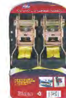
PART #: JTPH066

2PC 1" X 14" RATCHET TIE DOWN SET Break strength: 1,800 LBS Working Load Limit: 6,00 LBS Hook: Heat treated & vinyl coated S hooks