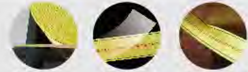
Triple Layer Webbing Web Guard Coating Flexible Edge Construction