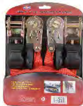
PART # - JTPH087

2PC 1' X 15' RATCHET TIE DOWN SET Break strength: 2,000 LBS Working Load Limit: 666 LBS Hook: Heat treated & vinyl coated S hooks