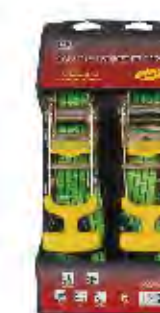
PART #: JTPH040 1-1/4" X 12' RATCHET TIE DOWN Break strength: 2,400 LBS Working Load Limit: 800 LBS Hook: Heat treated & vinyl coated S hooks