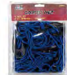
PART #: JIB0013

30" X 50" HEAVY DUTY CARGO NET ▶ Fast easy way to secure loads ▶ 12 nonmarring polypropylene hooks ▶ Super strong 5mm shock cords are protected with a tough long lasting fabric sleeve ▶ Weather resistant