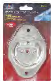
PART # - JIB0032