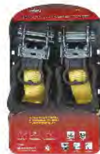
PART #: JTPH073

4PC 1-1/2" X 6' CAMBUCKLE TIE DOWN SET Break strength: 1,800 LBS Working Load Limit: 600 LBS Hook: Heat treated & vinyl coated S hooks