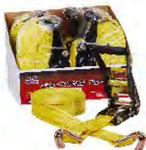
PART #: JTDB001

2' X 27' RATCHET TIE DOWN Break strength: 10,000 LBS Working Load Limit: 3,333 LBS Hook: Heavy duty double J hooks