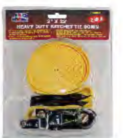
PART # - JIB0047