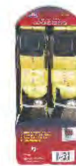
PART #: JTPH061

2PC 1" X 15" RATCHET TIE DOWN SET Break strength: 1,200 LBS Working Load Limit: 400 LBS Hook: Heat treated & vinyl coated S hooks