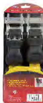
PART #: JTPH083

4PC 1" X 13' RATCHET TIE DOWN SET Break strength: 1,500 LBS Working Load Limit: 500 LBS Hook: Heat treated & vinyl coated S hooks