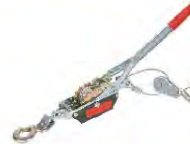
PART #: JIB-2TB1