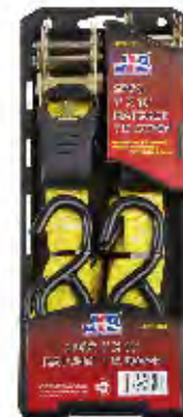
PART # - JTPH101

TIE DOWN SET 2pcs 1' x 10' cambuckle tie down Break strength: 900 lbs 1pcs 1.5' x 10' ratchet tie down Break strength: 3000 lbs