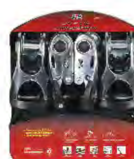
PART #: JTPH046 4PC 1" X 12' RATCHET TIE DOWN SET Break strength: 1,800 LBS Working Load Limit: 600 LBS Hook: Heat treated & vinyl coated S hooks