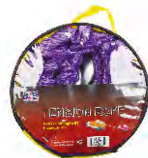
PART #: JTSP014