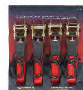
PART #: JTDP039