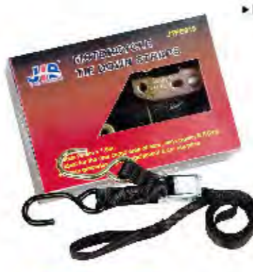
PART #: JTPB019 MOTORCYCLE TIE DOWN STRAPS ► Size: 25mm x 1.8m. ► Ideal for the rear cargo area of cars, vans trucks & SUVs. ► Store groceries, sports equipment & car supplies.