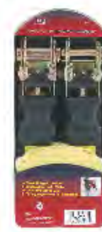
PART #: JTPH059

2PC 1" X 15" RATCHET TIE DOWN SET Break strength: 1,500 LBS Working Load Limit: 500 LBS Hook: Heat treated & vinyl coated S hooks