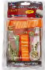
PART #: JTDC019 1" X 15' RATCHET TIE DOWN Break strength: 3,000 LBS Working Load Limit: 1,000 LBS Hook: Double J hooks