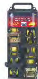
PART #: JTPH070

4PC 1-1/4" X 15' RATCHET TIE DOWN SET Break strength: 2,500 LBS Working Load Limit: 833 LBS Hook: Heat treated & vinyl coated S hooks