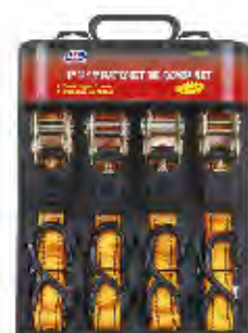
PART #: JTPH031 4PC 1" X 15' RATCHET TIE DOWN SET Break strength: 1,500 LBS Working Load Limit: 500 LBS Hook: Heat treated & vinyl coated S hooks