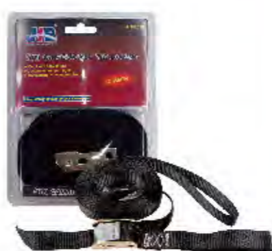
PART #: JTPB016 2PCS 25MM X 5M CAMBUCKLE TIE DOWN ► Break strength: 1200 lbs ► Quick and easy to use ► Just press and pull tight ► Nonmarring, vinyl coated hooks