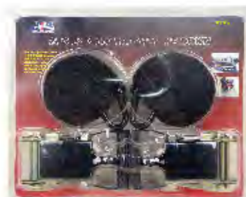
PART # - JIB0035