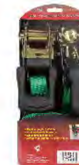
PART #: JTPH084

2PC 1" X 10' RATCHET TIE DOWN SET Break strength: 1,500 LBS Working Load Limit: 500 LBS Hook: Heat treated & vinyl coated S hooks