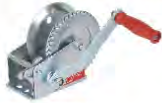
PART #: JIB-W1200