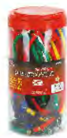
PART #: JBGB008