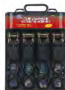
PART #: JTPH030 4PC 1" X 15' RATCHET TIE DOWN SET Break strength: 1,500 LBS Working Load Limit: 500 LBS Hook: Heat treated & vinyl coated S hooks