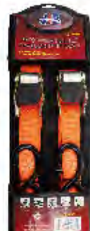
PART # - JTPH096

2' X 27' RATCHET TIE DOWN Break strength: 10000 lbs Hook: zinc plated double J hooks