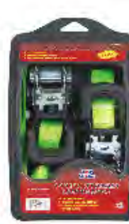
PART #: JTPH080

2PC 1-1/4" X 12' RATCHET TIE DOWN SET Break strength: 2,400 LBS Working Load Limit: 800 LBS Hook: Double J hooks