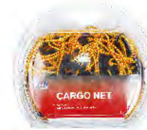
PART #: JIB0020

72" X 96" HEAVY DUTY CARGO NET ▶ Fast easy way to secure loads ▶ 22 nonmarring polypropylene hooks ▶ Super strong 5mm shock cords are protected with a tough long lasting fabric sleeve ▶ Weather resistant