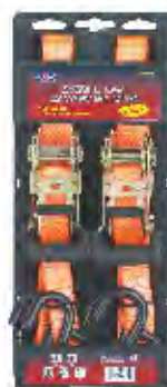
PART #: JTPH053

1-1/2" X 16" RATCHET TIE DOWN Break strength: 4,000 LBS Working Load Limit: 1,333 LBS Hook: Heat treated & vinyl coated S hooks