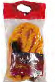
PART #: JTDC027 5/16" X 11' EMERGENCY TOW ROPE Break strength: 4,000 LBS Working Load Limit: 1,333 LBS