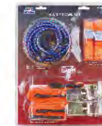
PART #: JIB0021

72" X 96" HEAVY DUTY CARGO NET ▶ Fast easy way to secure loads ▶ 22 nonmarring polypropylene hooks ▶ Super strong 5mm shock cords are protected with a tough long lasting fabric sleeve ▶ Weather resistant