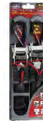
PART # - JTPH099

4PCS 1' X 15' RATCHET TIE DOWN Break strength: 1500 lbs Hook: heat treated & vinyl coated S hooks