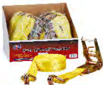
PART #: JTDB004

2' X 27' RATCHET TIE DOWN Break strength: 10,000 LBS Working Load Limit: 3,333 LBS Hook: Heavy duty double J hooks