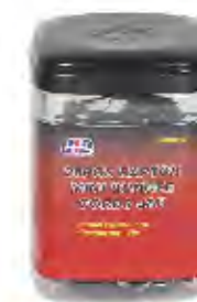
PART #: JBGB010