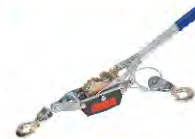
PART #: JIB-3TA1