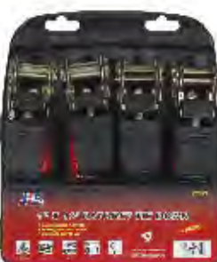
PART #: JTPH076

1-1/2" X 15' RATCHET TIE DOWN Break strength: 4,500 LBS Working Load Limit: 1,500 LBS Hook: Heat treated & vinyl coated S hooks