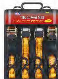
PART #: JTPH032 4PC TIE DOWN SET 2PC 1" X 15' Ratchet tie down Break strength: 1,500 LBS Working Load Limit: 500 LBS 2PC 1" X 12' Ratchet tie down Break strength: 900 LBS Working Load Limit: 300 LBS Hook: Heat treated & vinyl coated S hooks