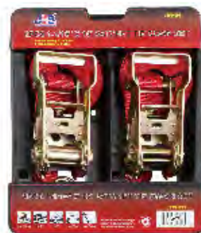
PART # - JTPH091

2PCS 1' X 12' CAMBUCKLE TIE DOWN SET Break strength: 1200 lbs Hook: heat treated & vinyl coated S hooks