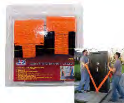
PART #: JTPB022 2PCS X MOVING BELT STRAP ► Width: 75mm; Length: 2.84m; Thickness: 1.45mm Break strength: 318kgs (700LBS) Color: orange High strength polypropylene webbing Adjustable straps. Straps encourage proper lifting techniques Saves floors from scratches, dents, scuffs and scrapes that dollies and hand trucks can leave behind Reduces back injuries due to heavy and repetitive lifting, protect yourself from hurting when moving