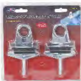
PART # - JIB0034