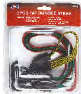
PART #: JIB0010

3PC 10MM X 24" CARABINER STYLE BUNGEE CORDS ▶ Super strong steel clipper hooks ▶ Anti-slip rubberized grip ▶ Spring gate looks secure