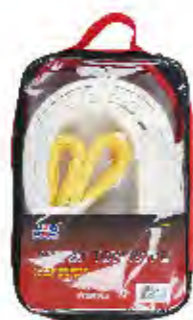
PART #: JTSP012