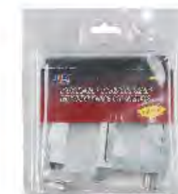
PART #: JIB0024