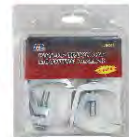
PART #: JIB0023