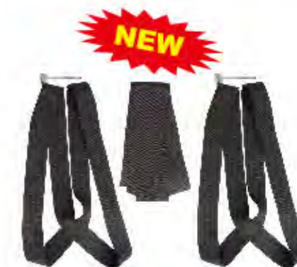
PART #: JTPB023 MOVING STRAPS ► Includes 2 harnesses & one 12' long x 5" lifting strap. ► This two person moving system will help move heavy, bulky items, safely. Easily and more efficiently. Perfect for office or home use. One size fits most. Lifting straps are perfect for moving heavy furniture and appliances.