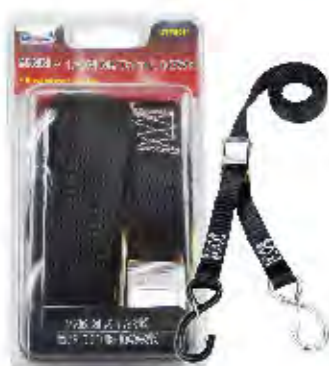
PART #: JTPB014 25MM X 1.75M MOTO TIE DOWN ► Break strength: 500 kgs