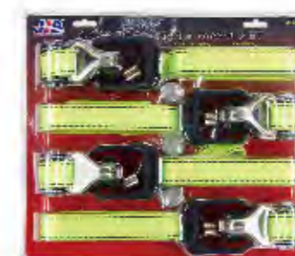
PART # - JIB0045