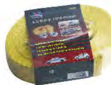
PART #: JTSP009 50mm x 1.8m TOW STRAP ► Break strength: 8,820 LBS