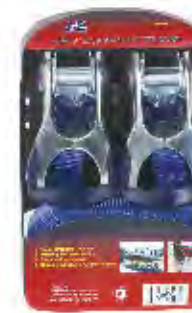
PART #: JTPH065

2" X 20" RATCHET TIE DOWN Break strength: 3,000 LBS Working Load Limit: 1,000 LBS Hook: Heat treated & vinyl coated S hooks