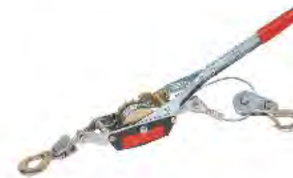
PART #: JIB-1TB1