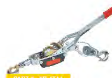
PART #: JIB-4TA1