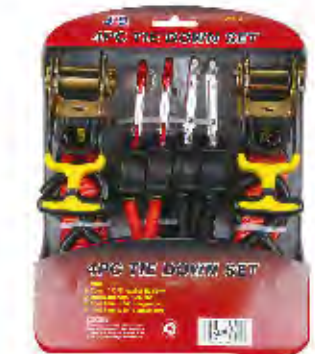
PART # - JTPH104

2PCS 1-1/2" X 6' CAMBUCKLE TIE DOWN Break strength: 1500 lbs Working load limit: 500 lbs