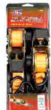
PART # - JTPH105

4PCS TIE DOWN SET 2pcs 1' x 10' ratchet tie down Break strength: 1200 lbs 1pcs 8mm x 24' bungee cord 1pcs 8mm x 36' bungee cord