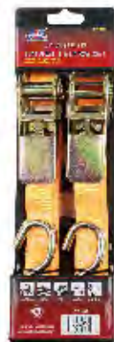
PART # - JTPH089

4PC TIE DOWN SET 2pcs 1' X 15' ratchet tie down Break strength: 1,500 LBS Working Load Limit: 500 LBS 2pcs 1' X 6' cambuckle tie down Break strength: 900 LBS Working Load Limit: 300 LBS Hook: Heat treated & vinyl coated S hooks