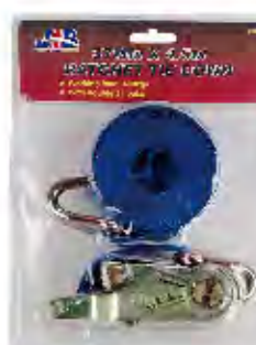
PART # - JIB0046