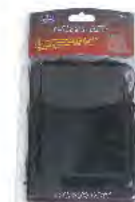
PART #: JTSP010 45' X 60' HEAVY DUTY CARGO NET