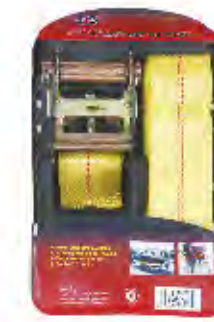
PART #: JTPH064

2PC 1" X 15" RATCHET TIE DOWN SET Break strength: 2,000 LBS Working Load Limit: 6,66 LBS Hook: Heat treated & vinyl coated S hooks