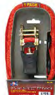
PART # - JTPH097

1' X 15' RATCHET TIE DOWN Break strength: 1500 lbs Hook: heat treated & vinyl coated S hooks