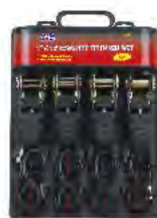
PART #: JTPH029 4PC 1" X 15' RATCHET TIE DOWN SET Break strength: 900 LBS Working Load Limit: 300 LBS Hook: Heat treated & vinyl coated S hooks