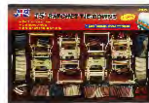
PART #: JTDP006

4PC 1" X 15' RATCHET TIE DOWNS SET W/ CAMOUFLAGE STRAP