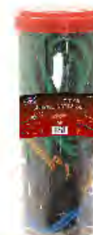
PART #: JBGB013