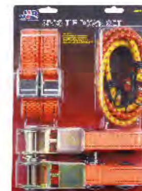
PART # - JIB0042