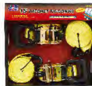
PART #: JTDP028

2PC 1-1/2" X 15' RATCHET TIE DOWNS SET W/ RUBBER GRIP