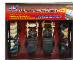
PART #: JTDP018

2PC 1" X 15' RATCHET TIE DOWNS SET W/ CAMOUFLAGE STRAP & RUBBER GRIP