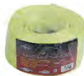
PART #: JTSP008 100mm x 9m HEAVY DUTY TOW STRAP ► Break strength: 20,000 LBS