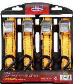
PART # - JTPH093

2PCS 1' X 15' RATCHET TIE DOWN SET Break strength: 1500 lbs Hook: heat treated & vinyl coated s hooks