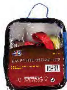
PART #: JTSP015