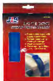
PART #: JTPB020 4PC TIE DOWN STRAP PROTECTORS ► Foam cushion pad with plastic attachment ► Protect items during moving & storage ► Weather resistant ► Fits straps up to 50mm ► L x W: 180 x 59mm