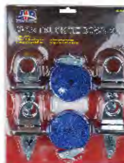
PART # - JIB0044