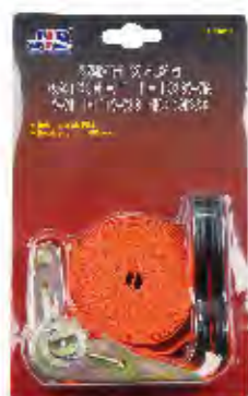
PART #: JTPB010 25MM X 4.8M RATCHET TIE DOWN WITH TWO HOOKS ► Belt material: PES ► Break strength: 450 kgs