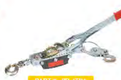
PART #: JIB-4TB1