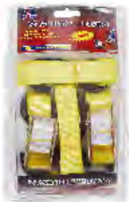
PART #: JTDC026 1" X 12' CAMBUCKLE TIE DOWN Break strength: 1,200 LBS Working Load Limit: 400 LBS Hook: Heat treated & vinyl coated S hooks