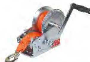
PART #: JIB-S3000