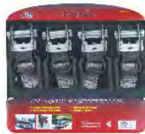
PART #: JTPH063

4PC 1" X 15' RATCHET TIE DOWN SET Break strength: 1,500 LBS Working Load Limit: 5,00 LBS Hook: Heat treated & vinyl coated S hooks