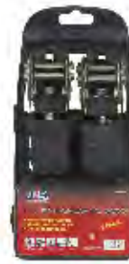
PART #: JTPH077

2PC 1" X 13' RATCHET TIE DOWN SET Break strength: 1,500 LBS Working Load Limit: 5,00 LBS Hook: Heat treated & vinyl coated S hooks