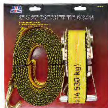
PART # - JIB0039