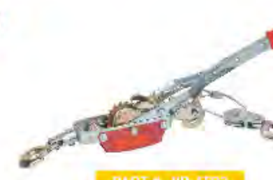
PART #: JIB-4TB2