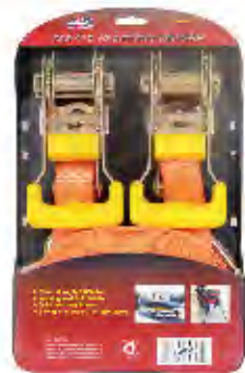
PART # - JTPH086

2PC 1' X 15' RATCHET TIE DOWN SET Break strength: 2,000 LBS Working Load Limit: 666 LBS Hook: Heat treated & vinyl coated S hooks