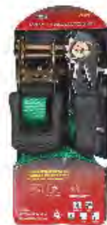
PART #: JTPH071

1" X 10' HIGHER LOAD TIE DOWN Break strength: 1,800 LBS Working Load Limit: 1600 LBS Hook: Heat treated & vinyl coated S hooks