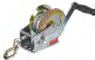
PART #: JIB-C1000