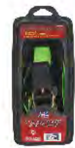
PART #: JTPH079

4PC 1" X 15' RATCHET TIE DOWN SET Break strength: 3,000 LBS Working Load Limit: 1,000 LBS Hook: Heat treated & vinyl coated S hooks