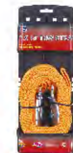
PART #: JTPH033 2" X 15' TOW STRAP Break strength: 6,500 LBS Working Load Limit: 2,000 LBS Rust-resistant hooks with safety clips