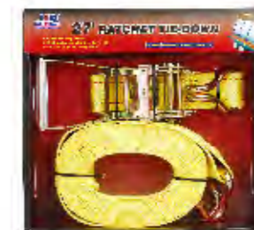
PART #: JTDP030