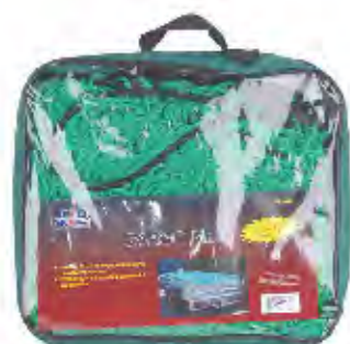
PART #: JTSP011