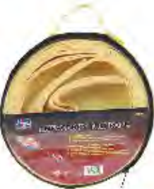
PART #: JTDC025 2" X 15' EMERGENCY TOW ROPE Break strength: 10,000 LBS Working Load Limit: 3,333 LBS