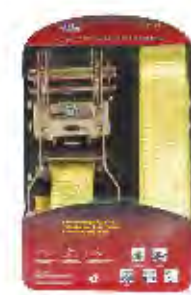
PART #: JTPH075

2PC 1-1/2" X 10' RATCHET TIE DOWN SET Break strength: 3,000 LBS Working Load Limit: 1,000 LBS Hook: Double J hooks