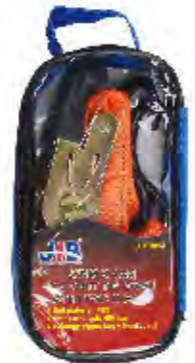
PART #: JTPB013 25MM X 4.8M RATCHET TIE DOWN WITH TWO HOOKS ► Belt material: PES ► Break strength: 450 kgs ► Packing: zipper bag + Insert card