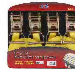
PART #: JTPH078

2PC 1" X 13' RATCHET TIE DOWN SET Break strength: 1,500 LBS Working Load Limit: 5,00 LBS Hook: Heat treated & vinyl coated S hooks