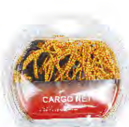
PART #: JIB0014

40" X 60" CARGO NET ▶ Fast easy way to secure loads ▶ 16 durable adjustable hooks ▶ Super strong 5mm shock cords are protected with a tough long lasting fabric sleeve ▶ Weather resistant