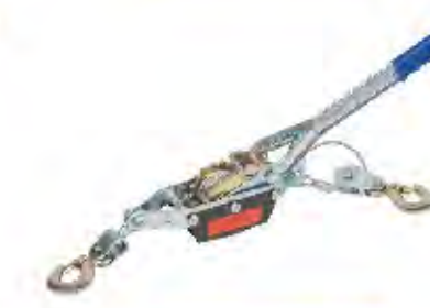
PART #: JIB-3TB1