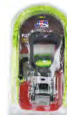
PART # - JIB0043