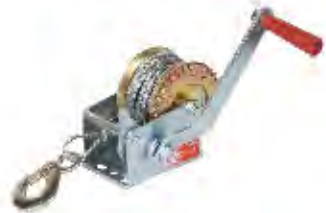
PART #: JIB-C600