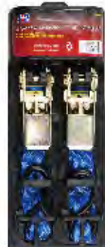
PART # - JTPH092

2PCS 1-1/16" X 15' RATCHET TIE DOWN SET Break strength: 3000 lbs Hook: double J hooks