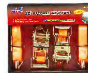
PART #: JTDP021