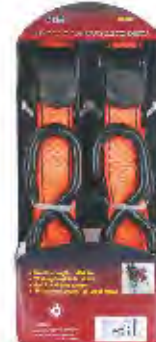
PART #: JTPH058

2PC 2" X 20" HEAVY DUTY RATCHET TIE DOWN SET Break strength: 4,500 LBS Working Load Limit: 1,500 LBS Hook: Double J hooks