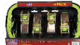
PART # - JTPH098

1' X 15' RATCHET TIE DOWN Break strength: 1500 lbs Hook: heat treated & vinyl coated S hooks