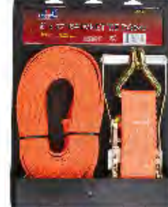
PART # - JTPH095

2PCS 1' X 15' RATCHET TIE DOWN SET Break strength: 1500 lbs Hook: heat treated & vinyl coated s hooks