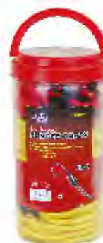
PART #: JBGB003