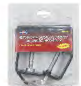
PART #: JIB0025