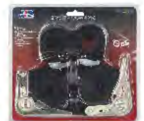
PART #: JIB0030