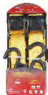
PART #: JTPH072

2PC 1" X 8' RATCHET TIE DOWN SET Break strength: 2,000 LBS Working Load Limit: 666 LBS Hook: Heat treated & vinyl coated S hooks