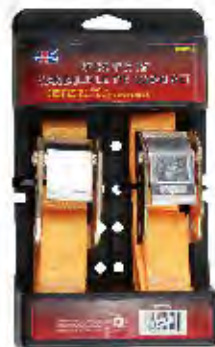
PART # - JTPH090

2PCS 1' X 15' RATCHET TIE DOWN SET Break strength: 1500 lbs Hook: zinc plated S hooks