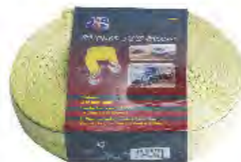
PART #: JTSP005 50mm x 9m TOW STRAP ► Break strength: 3,333 LBS