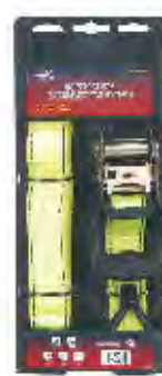
PART #: JTPH052

1" X 8" RATCHET TIE DOWN Break strength: 3,000 LBS Working Load Limit: 1,000 LBS Hook: Heat treated & vinyl coated S hooks