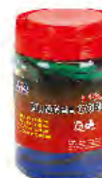
PART #: JBGB006