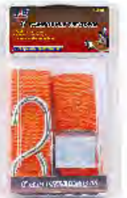
PART #: JTDC023 2" X 6' CAMBUCKLE TIE DOWN Break strength: 3,000 LBS Working Load Limit: 1,000 LBS Hook: Heat treated & zinc plated S hooks