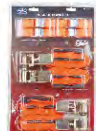
PART #: JIB0022

8PC TIE DOWN SET Includes: ▶ 2pc 8mm X 46cm bungee cord ▶ 2pc 8mm X 64cm bungee cord ▶ 2pc 25mm X 2.6m cambuckle tie down ▶ 2pc 25mm X 3.5m ratchet tie down