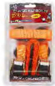
PART #: JTDC021 1" X 12' CAMBUCKLE TIE DOWN W/ RUBBER GRIP Break strength: 1,200 LBS Working Load Limit: 400 LBS Hook: Heat treated & vinyl coated S hooks