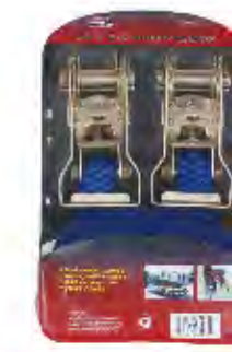
PART #: JTPH063

2PC 1" X 6" RATCHET TIE DOWN SET Break strength: 2,000 LBS Working Load Limit: 6,66 LBS Hook: Heat treated & vinyl coated S hooks