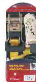
PART #: JTPH062

2PC 1-1/2" X 8" CAMBUCKLE TIE DOWN SET Break strength: 1,800 LBS Working Load Limit: 600 LBS