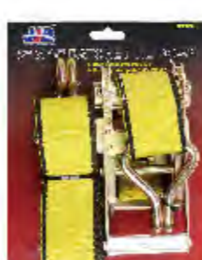
PART # - JIB0038