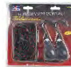
PART #: JIB0028