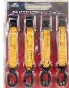
PART # - JIB0037