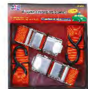
PART #: JTDP037