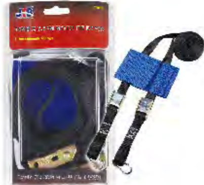
PART #: JTPB015 25MM X 3.35M MOTO TIE DOWN ► Break strength: 400 kgs