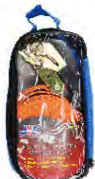
PART #: JTPB012 25MM X 5M RATCHET TIE DOWN WITHOUT HOOK ► Belt material: polypropylene ► Break strength: 300 kgs ► Packing: zipper bag + Insert card