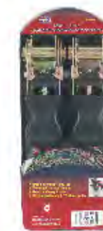
PART #: JTPH060

2PC 1" X 15" RATCHET TIE DOWN SET Break strength: 1,500 LBS Working Load Limit: 500 LBS Hook: Heat treated & vinyl coated S hooks