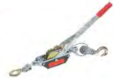
PART #: JIB-2TA1