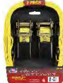
PART # - JTPH094

4PCS 1' X 12' CAMBUCKLE TIE DOWN SET Break strength: 900 lbs Hook: heat treated & vinyl coated s hooks