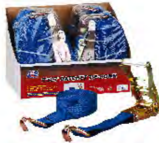
PART #: JTDB002

2' X 27' RATCHET TIE DOWN Break strength: 10,000 LBS Working Load Limit: 3,333 LBS Hook: Heavy duty double J hooks