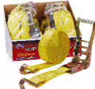
PART #: JTDB003

2' X 27' RATCHET TIE DOWN Break strength: 10,000 LBS Working Load Limit: 3,333 LBS Hook: Heavy duty double J hooks