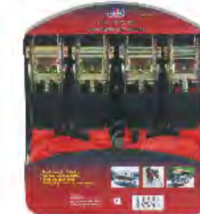
PART #: JTPH067

2PC 1-1/4" X 10" RATCHET TIE DOWN SET Break strength: 3,000 LBS Working Load Limit: 1,000 LBS Hook: Heat treated & vinyl coated S hooks