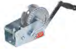
PART #: JIB-W2000