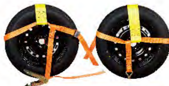
PART #: JTDB003-3 TYRE FIX