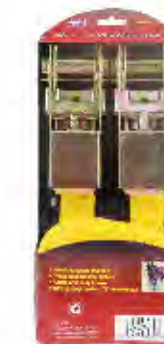
PART #: JTPH081

2PC 1-1/16" X 6' HIGHER LOAD TIE DOWN SET Break strength: 3,000 LBS Working Load Limit: 1,000 LBS Hook: Heat treated & vinyl coated S hooks