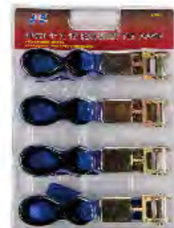
PART # - JIB0041-1