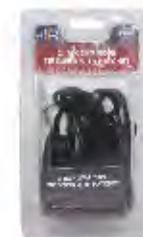
PART #: JIB0026