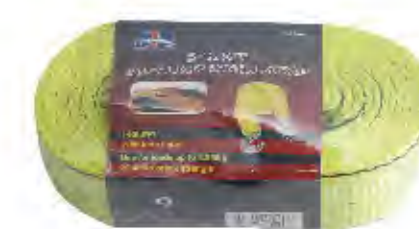
PART #: JTSP007 50mm x 2.4m SOFT LOOP WINCH STRAP ► Break strength: 20,000 LBS