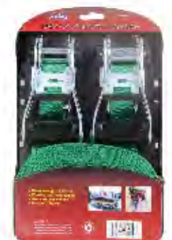
PART #: JTPH085

2PC 1" X 6' RATCHET TIE DOWN SET Break strength: 2,000 LBS Working Load Limit: 666 LBS Hook: Heat treated & vinyl coated S hooks