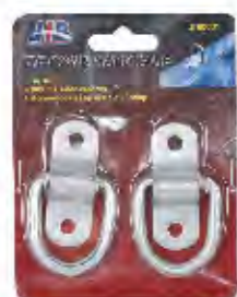
PART # - JIB0031