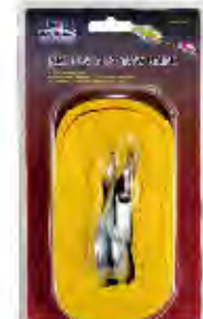
PART #: JTDC024 2" X 13' EMERGENCY TOW ROPE Break strength: 6,000 LBS Working Load Limit: 2,000 LBS