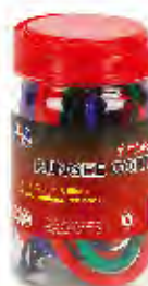
PART #: JBGB005