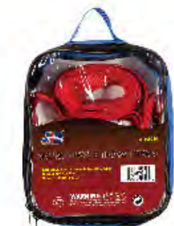
PART #: JTSP016