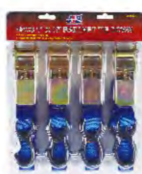
PART # - JIB0041