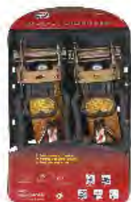
PART #: JTPH074

2PC 1" X 15' RATCHET TIE DOWN SET Break strength: 900 LBS Working Load Limit: 300 LBS Hook: Heat treated & vinyl coated S hooks