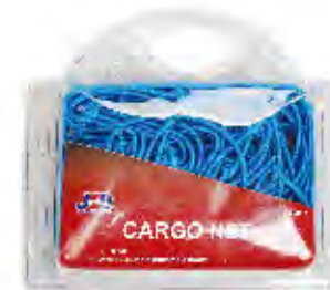
PART #: JIB0012

6PC BUNGEE CORDS ▶ 2pcX8mmX24", 2pcX8mmX30", 2pcX8mmX42" ▶ Heat treated steel core hooks ▶ Spring coiled steel more stronger ▶ Smooth plastic coating prevents scratches