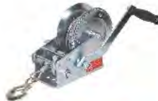
PART #: JIB-C2500