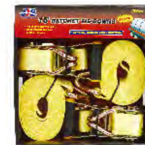
PART #: JTDP025

2PC 1-1/2" X 15' RATCHET TIE DOWNS SET W/ RUBBER GRIP