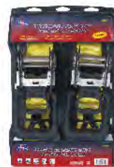
PART #: JTPH057

4PC 1" X 16" CAMBUCKLE TIE DOWN SET Break strength: 1,500 LBS Working Load Limit: 500 LBS Hook: Heat treated & vinyl coated S hooks