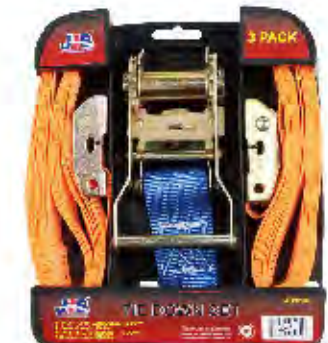
PART # - JTPH100

2PCS 1' X 6' RATCHET TIE DOWN Break strength: 1800 lbs Hook: heat treated & vinyl coated S safety hooks