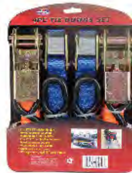
PART # - JTPH088

4PC 1' X 15' RATCHET TIE DOWN SET Break strength: 1,500 LBS Working Load Limit: 500 LBS Hook: Heat treated & vinyl coated S hooks