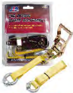
PART #: JTPB017 TIE DOWN RAMP ASSEMBLE ► 1 x 25mm Ratchet Assembly with M12 ► 1 x 25mm x 0.8m with M10