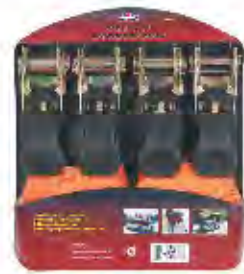
PART #: JTPH060

4PC 1" X 15' RATCHET TIE DOWN SET Break strength: 1,500 LBS Working Load Limit: 5,00 LBS Hook: Heat treated & vinyl coated S hooks