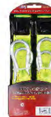
PART # - JTPH103

TIE DOWN SET 2pcs 1' x 12' ratchet tie down Break strength: 1500 lbs 2pcs 1' x 15' cambuckle tie down Break strength: 1200 lbs