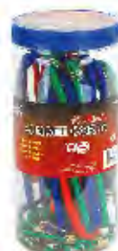
PART #: JBGB007