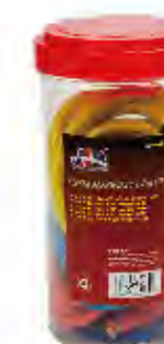
PART #: JBGB015