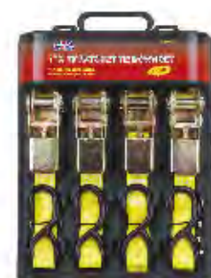
PART #: JTPH028 4PC 1" X 10' RATCHET TIE DOWN SET Break strength: 1,500 LBS Working Load Limit: 500 LBS Hook: Heat treated & vinyl coated S hooks