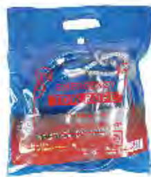
PART #: JTDC026 5/16" X 13' EMERGENCY TOW ROPE Break strength: 6,000 LBS Working Load Limit: 2,000 LBS