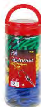
PART #: JBGB002