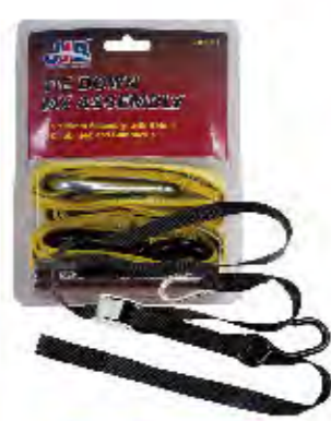
PART #: JTPB018 TIE DOWN MX ASSEMBLE ► 1 x 25mm Assembly, with S-Hook, Carabiner, and Cam buckle