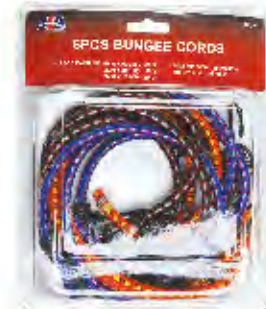
PART #: JIB0011

3PC FAT BUNGEE CORD ▶ 19mmX15", 19mmX25", 19mmX35" ▶ Super strong steel core hooks ▶ Anti-slip rubberized grip ▶ Smooth plastic coating prevents scratches ▶ Heavy duty polypropylene braid with high grade rubber cord for optimum elasticity