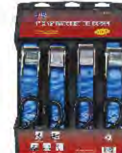
PART #: JTPH041 1" X 12' CAMBUCKLE TIE DOWN Break strength: 900 LBS Working Load Limit: 300 LBS Hook: Heat treated & vinyl coated S hooks