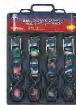
PART #: JTPH055

2PC 1" X 16" CAMBUCKLE TIE DOWN SET Break strength: 900 LBS Working Load Limit: 300 LBS