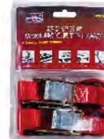
PART # - JIB0048