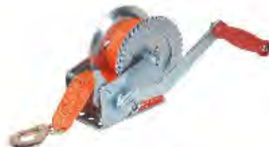
PART #: JIB-S1200