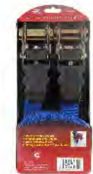
PART #: JTPH082

2PC 1" X 15' RATCHET TIE DOWN SET Break strength: 900 LBS Working Load Limit: 300 LBS Hook: Heat treated & vinyl coated S hooks