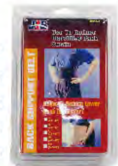
PART # - JIB0049