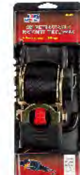
PART # - JTPH106

3M RETRACTABLE RATCHET TIE DOWN Break strength: 3000 lbs