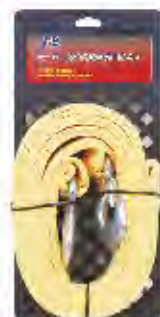
PART #: JTPH034 2" X 15' TOW STRAP Break strength: 10,000 LBS Working Load Limit: 3,333 LBS Rust-resistant hooks with safety clips