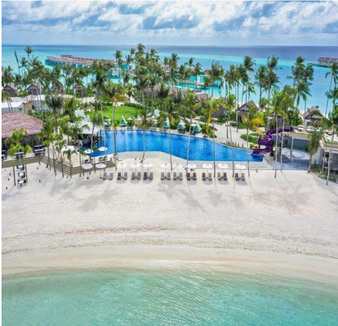
Hard Rock Hotel