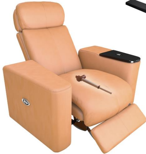
Power Recliners ↻