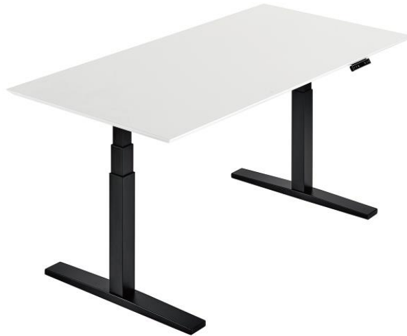
Height Adjustable Table ↻

PROFESSIONAL MANUFACTURER FOR THE LINEAR ACTUATOR SYSTEM