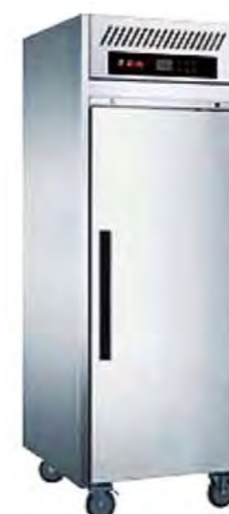
Europe Type Upright Chiller 1 Channel Door 304SCKE-U1M-HD-PT

Main material: SS 304 Dimension(mm): 737x815x1975 Voltage: 220V/50Hz Volume: 555L Temperature: -2°C~+4°C Compressor: Embraco Doors: stainless steel doors Shelves: 4pcs