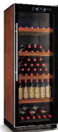
Wine Cooler(Compressor) WC-V308-120

Dimension(mm): 598x605x1250 Ventilated Capacity: 208L, 84 bottles Temperature: 5~22°C Power: 120W Packing Size: 660x640x1300mm Weight: 73kg Working Temperature: 0-38°C