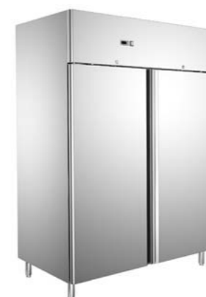
Upright Freezer With 2 Full Doors

Size (LxWxH mm): 1340x800x2040 Type of cooling: Ventilated Temperature: +2~+8°C Packing Size(LxWxH mm): 1380x850x2050 Refrigerant Gas: R134a Net Weight (kgs): 136 Gross Weight(kgs): 150 Qty Of 20FT: 10 Qty of 40FT: 22 Qty of 40 HQ FT: 22 CE Approval