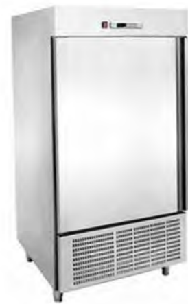
Blast Freezer CK-HBF10

Dimension(LxWxH): 800x815x1015mm Voltage: 230V/50Hz Net weight: 95 kg Interior size: 600x420x400mm Temperature: 70/3°C in 90min Temperature: 70/-18°C in 240min Power: 801 W Capacity: 5 1/1 GN