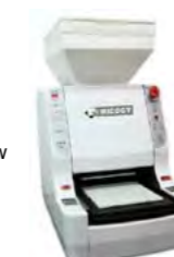
Rice Sheet Robot SPJX-CD02

Dimension: 328x483x653mm Voltage: AC100-230V,50/60hz,65w Sushi Weight: 18-20g N.W: 30Kg 700~300pcs can be produced per hour