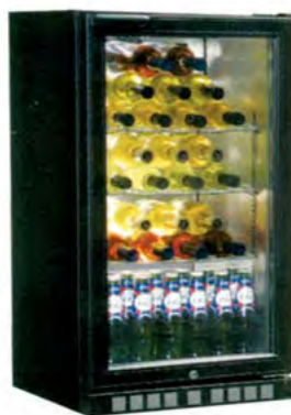
Back Bar Bottle Cooler BC-D1

Exteriou Size(LxWxH): 800x815x2170mm Interior Size: 600x420x1170 mm Voltage: 230V/50Hz Power: 2000W Pan support(GN/1): 14Prirs Pan support(400x600mm): 14Prirs