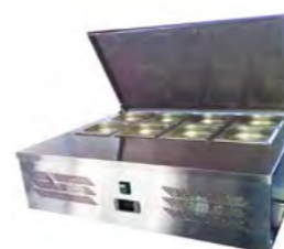
Refrigerant Bain Marie CKA-S01

Dimension: 392x591x699mm Voltage: 100-230V/50/60Hz Power: 150W Sushi Weight: 70-90g(S), 120-150g(M),200-270g(L) N.W: 66Kg