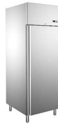
Upright Chiller With 1 Full Door