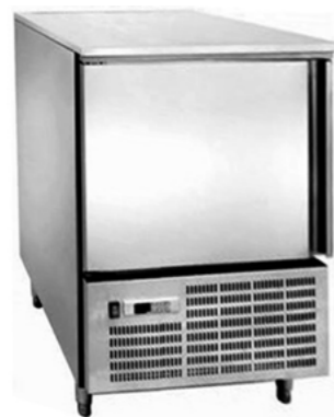
Blast Freezer CK-HBF5

Dimension(LxWxH): 800x815x925mm Voltage: 230V/50Hz Interior size: 600x420x330mm Temperature: 70/3°C in 90min Temperature: 70/-18°C in 240min Power: 703 W Capacity: 3 1/1 GN