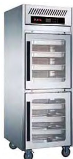
Europe Type Upright Chiller 2 Half Glass Door 304SCKE-U1M-HD-GD

Main material: SS 304 Dimension(mm): 737x815x1975 Voltage: 220V/50Hz Volume: 450L Temperature: -2°C~+4°C Compressor: Embraco Doors: stainless steel doors Shelves: 4pcs