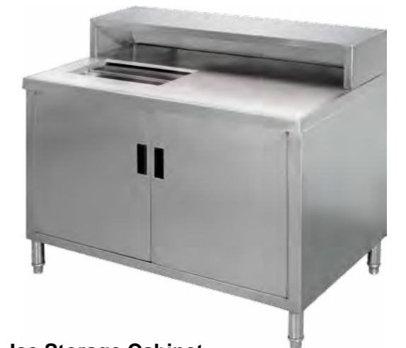
Ice Storage Cabinet