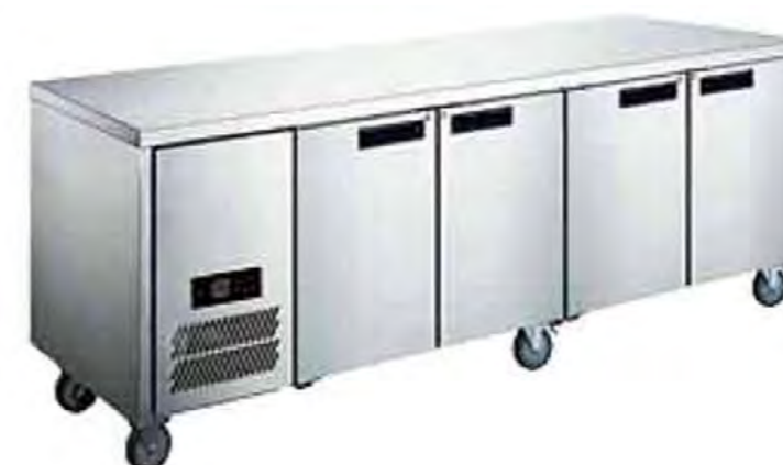
Europe Type Counter Chiller 4 Door 304SCKE-14M-XDDDD

Main material: SS 304 Dimension(mm): 1885x700x850 Voltage: 220V/50Hz Volume: 423L Temperature: -2°C~4°C Compressor: Embraco Doors: stainless steel doors Shelves: 6pcs