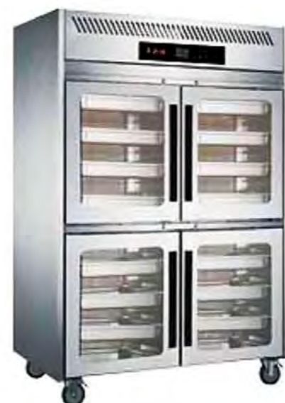
Europe Type Upright Chiller 4 Half Glass Door 304SCKE-U2M-HD-GD

Main material: SS 304 Dimension(mm): 737x815x1975 Voltage: 220V/50Hz Volume: 555L Temperature: -2°C~+4°C Compressor: Embraco Doors: stainless steel doors Shelves: 4pcs