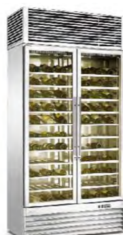
Wine Cooler(Compressor) WC-V960-280

Dimension(mm): 598x605x1650 Cooling Mode: Static Capacity: 308L, 84 bottles Temperature: 5~22°C Power: 120W Packing Size: 660x640x1700mm Weight: 116kg Working Temperature: 0-38°C