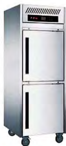
Upright Chiller 2 Half Door 304SCK-UC395-2

Main material: SS 304 Dimension(mm): 620x760x1980 Voltage: 220V/50Hz Power: 427W Volume: 395L Temperature: -5°C~10°C Compressor: Embraco Refrigerant: R134a Cool mode: Ventilated