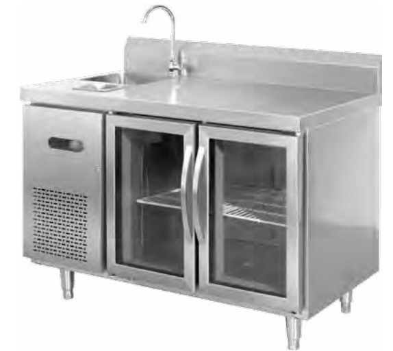
Chilling Worktable With Sink