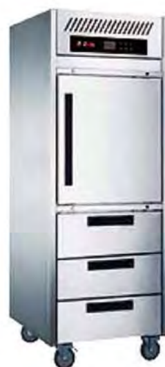
Europe Type Upright Chiller 1 Half Door with 3 Drawers 304SCKE-U1M-WD

Main material: SS 304 Dimension(mm): 1800x760x1980 Voltage: 220V/50Hz Power: 887W Volume: 1340L Temperature: -5°C~+10°C Compressor: Embraco Refrigerant: R404A Cool mode: Ventilated Doors: 6 stainless steel doors