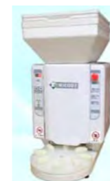
Sushi Robot SPJX-CD03

Size(mm): 1800x376x385 Temperature: 2~8°C Refrigerant: R134a Voltage: 220v/50hz Power: 600W Power Consumption: 14.4kw/24h Capacity: 131L