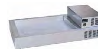
Refrigerated Top R60-2C

Main material: sus: 304 Size (LxWxH mm): 770x620x200 Type of cooling: Ventilated Temperature: 2-8°C Refrigerant Gas: R134a GN: 8x1/6x100mm