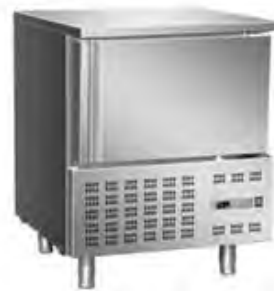
Blast Freezer CK-HBF3

Dimension(LxWxH): 800x815x925mm Voltage: 230V/50Hz Interior size: 600x420x330mm Temperature: 70/3°C in 90min Temperature: 70/-18°C in 240min Power: 703 W Capacity: 3 1/1 GN