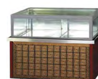
Chocolate Showcase CS-ZCHO2

Computer delay protection, Automatic Defogger with humidification, 2 drawers