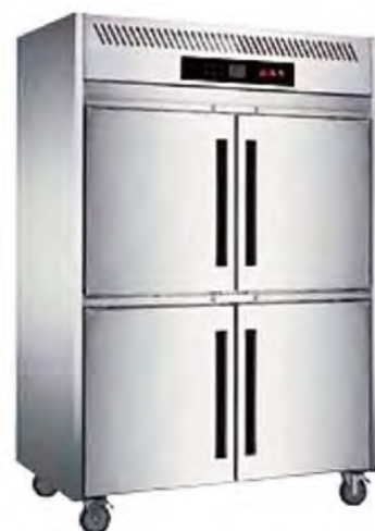
Upright Chiller 4 Half Door 304SCK-UC865-4

Main material: SS 304 Dimension(mm): 620x760x1980 Voltage: 220V/50Hz Power: 427W Volume: 395L Temperature: -5°C~10°C Compressor: Embraco Refrigerant: R134a Cool mode: Ventilated