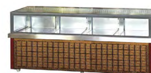
Chocolate Showcase CS-ZCHO3

Computer delay protection, Automatic Defogger with humidification, 3 drawers