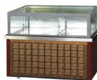
Chocolate Showcase CS-ZCHO1

Size(mm): 1130x850x900 Temperature: 2~8°C Refrigerant: R134a Voltage: 220v/50hz Power(w): 500 Power consumption(kw/24h): 8.5 Capacity(L): 169