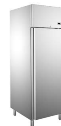
Upright Freezer With 1 Full Door

Size (LxWxH mm): 660x780x2010 Type of cooling: Ventilated Temperature: +2~+8°C Packing Size(LxWxH mm): 730x850x2050 Refrigerant Gas: R134a Capacity: 527L Shelf: 3 Net Weight (kgs): 106 Gross Weight(kgs): 120 Qty Of 20FT: 18 Qty of 40FT: 39 Qty of 40 HQ FT: 39 CE Approval