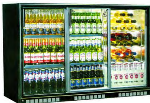
Back Bar Bottle Cooler BC-D3

Dimension(LxWxH): 920x510x895mm Temperature: 2-10 °C Power: 145 W Door: 3 pcs Volume: 303L Mode: Air Cooling Refrigerant: R134a