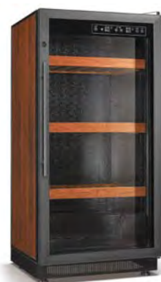
Wine Cooler(Compressor) WC-V208-84

Dimension(mm): 598x605x1250 Ventilated Capacity: 208L, 84 bottles Temperature: 5~22°C Power: 120W Packing Size: 660x640x1300mm Weight: 73kg Working Temperature: 0-38°C