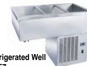
Drop-in Refrigerated Well ZCSB-XB157

Voltage: 220V/50z Power: 350W Capacity: 2xGN1/1 N.W.: 36kg Size: 1100x680x285mm