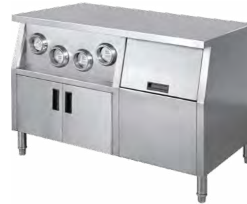
Center Island Work Station