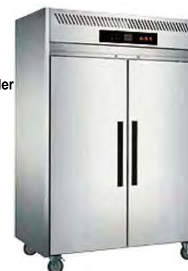
Europe Type Upright Chiller 2 Channel Door 304SCKE-U2M-FD-PT

Main material: SS 304 Dimension(mm): 737x815x1975 Voltage: 220V/50Hz Volume: 555L Temperature: -2°C~+4°C Compressor: Embraco Doors: stainless steel doors Shelves: 4pcs