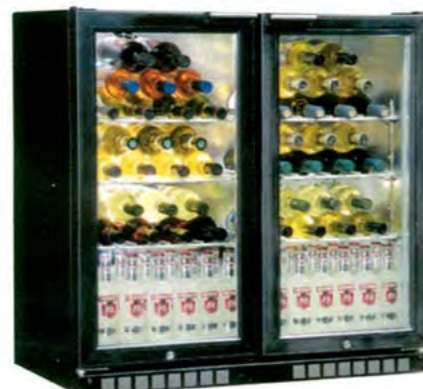
Back Bar Bottle Cooler BC-D2

Dimension(LxWxH): 600x510x895mm Temperature: 2-10 °C Power: 145 W Door: 1 pcs Volume: 115L Mode: Air Cooling Refrigerant: R134a