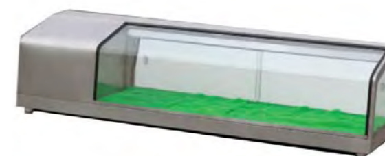
Sushi Showcase SU-Z12

Computer delay protection, Automatic Defogger with humidification, 4 drawers