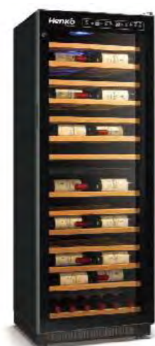
Wine Cooler(Compressor) WC-V308-84

Dimension(mm): 598x605x1650 Ventilated Capacity: 308L, 120 bottles Temperature: 5~22°C Power: 165W Packing Size: 660x640x1700mm Weight: 88kg Working Temperature: 0-38°C