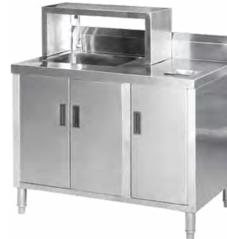
Single Compartment Sink With Over Shelf