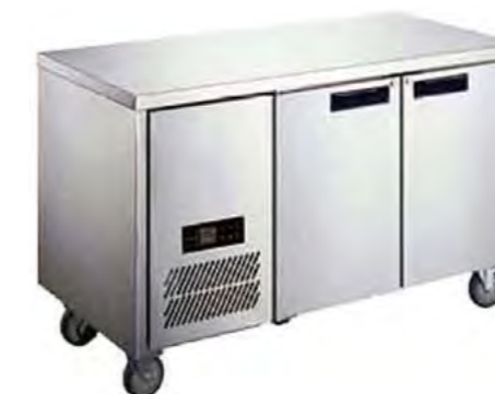
Europe Type Counter Chiller 2 Door 304SCKE-C12M-XDD

Main material: SS 304 Dimension(mm): 1400x815x1975 Voltage: 220V/50Hz Volume: 1182L Temperature: -2°C~+4°C Compressor: Embraco Doors: stainless steel doors Shelves: 8pcs