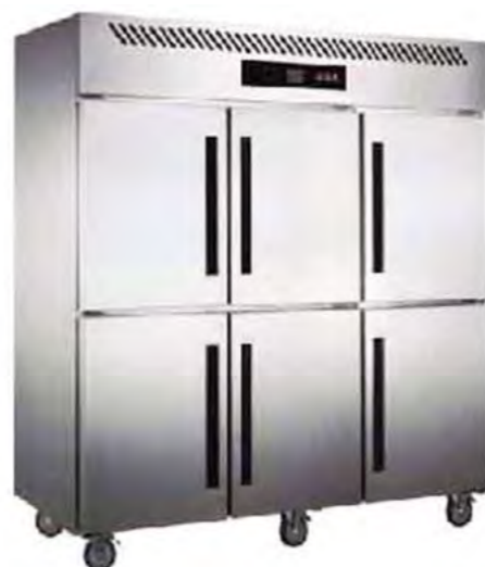
Upright Freezer 6 Half Door 304SCK-UC1340-6

Main material: SS 304 Dimension(mm): 1210x760x1980 Voltage: 220V/50Hz Power: 633W Volume: 865L Temperature: -5°C~10°C Refrigerant: R134a Cool mode: Ventilated Compressor: Embraco