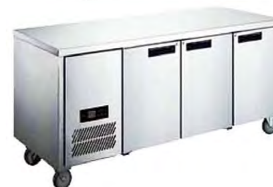
Europe Type Counter Chiller 3 Doors 304SCKE-C13M-X2D

Main material: SS 304 Dimension(mm): 1420x700x850 Voltage: 220V/50Hz Volume: 274L Temperature: -2°C~4°C Compressor: Embraco Doors: stainless steel doors Shelves: 4pcs