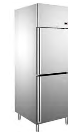
Upright Chiller With 2 Half Doors

Size (LxWxH mm): 1340x800x2040 Type of cooling: Ventilated Temperature: +2~+8°C Packing Size(LxWxH mm): 1380x850x2050 Refrigerant Gas: R134a Net Weight (kgs): 136 Gross Weight(kgs): 150 Qty Of 20FT: 10 Qty of 40FT: 22 Qty of 40 HQ FT: 22 CE Approval