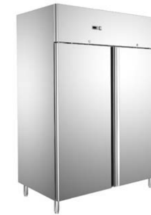
Upright Chiller With 2 Full Doors

Size (LxWxH mm): 660x780x2010 Type of cooling: Ventilated Temperature: -18 ~-22°C Packing Size(LxWxH mm): 730x850x2050 Refrigerant Gas: R134a Capacity: 527L Shelf: 3 Net Weight (kgs): 111 Gross Weight(kgs): 116 Qty Of 20FT: 18 Qty of 40FT: 39 Qty of 40 HQ FT: 39 CE Approval