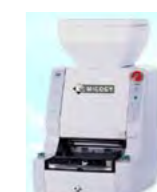
Rice Sheet Robot SPJX-CD01

Dimension: 392x591x699mm Voltage: 110V-240V Power: 50/60hz,150W Weight: 48kg Compact and simple stype